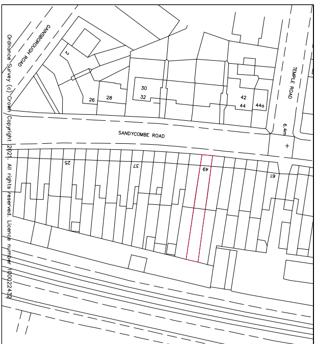
Location Plan 1:1250 Scale Bar @ 1:1250

This drawing is the property of Studio 136 Architects Ltd and is not to be reproduced, stored in a retrieval system, or transmitted in any form or by any means, electronic, mechanical, photocopying, recording, or otherwise, without the written consent of Studio 136 Architects Ltd. Any use of this drawing for any purpose other than that intended by Studio 136 Architects Ltd prior to writing and/or oral agreement by the client is prohibited.