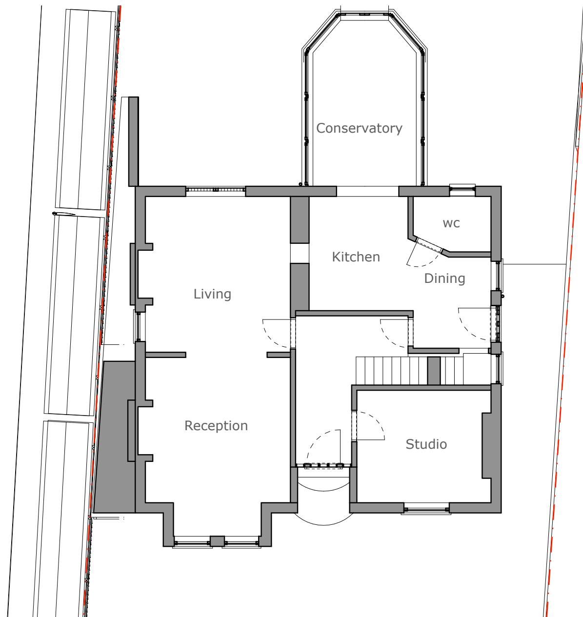
EXISTING GROUND FLOOR PLAN Scale 1:100@A3