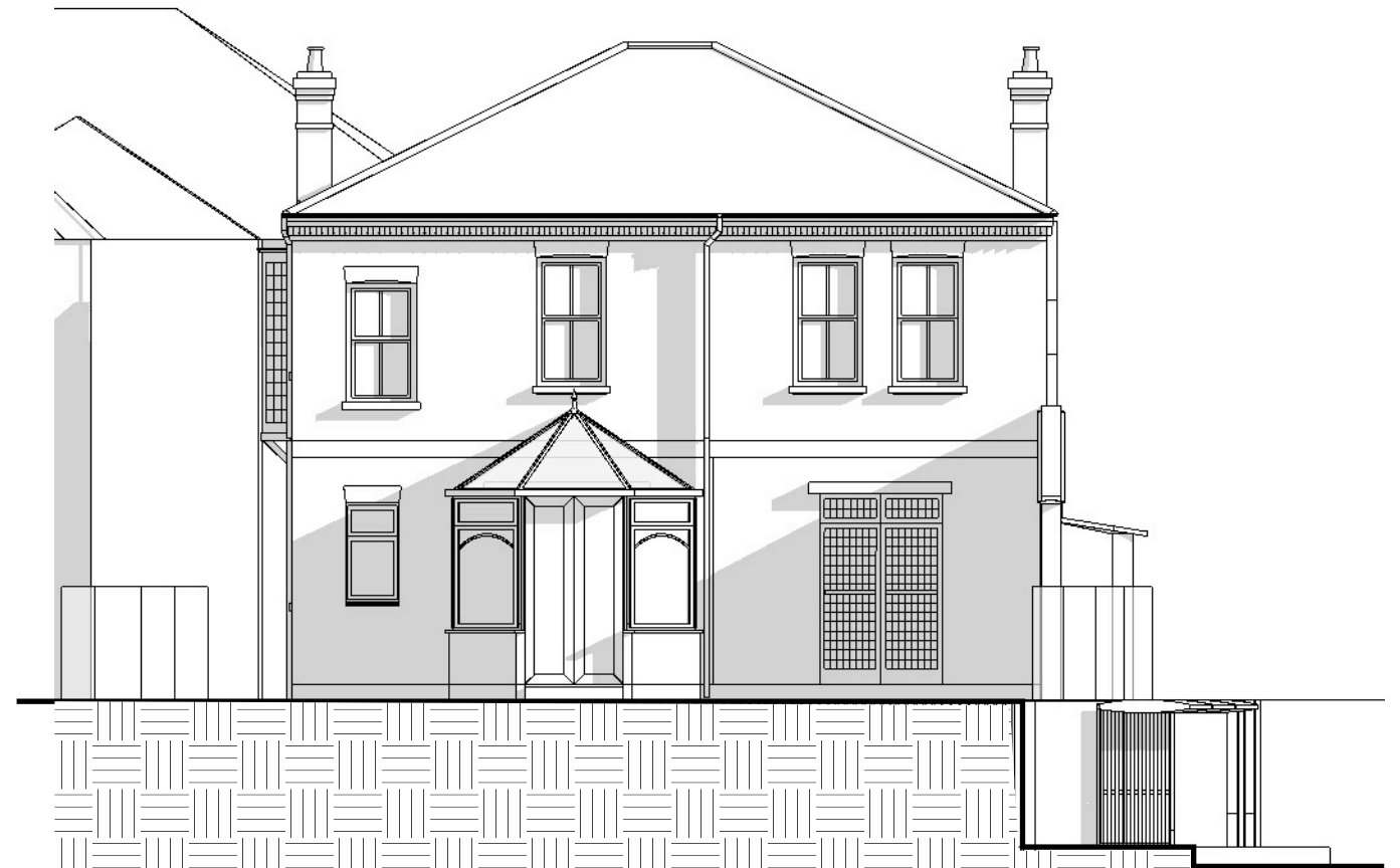
2-EXISTING REAR ELEVATION Scale 1:100@A3