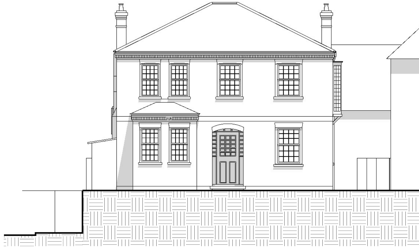
1-EXISTING FRONT ELEVATION Scale 1:100@A3