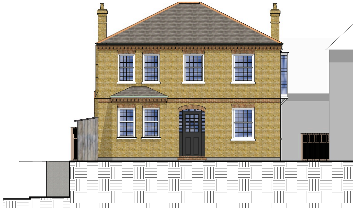
1-EXISTING FRONT ELEVATION Scale 1:100@A3