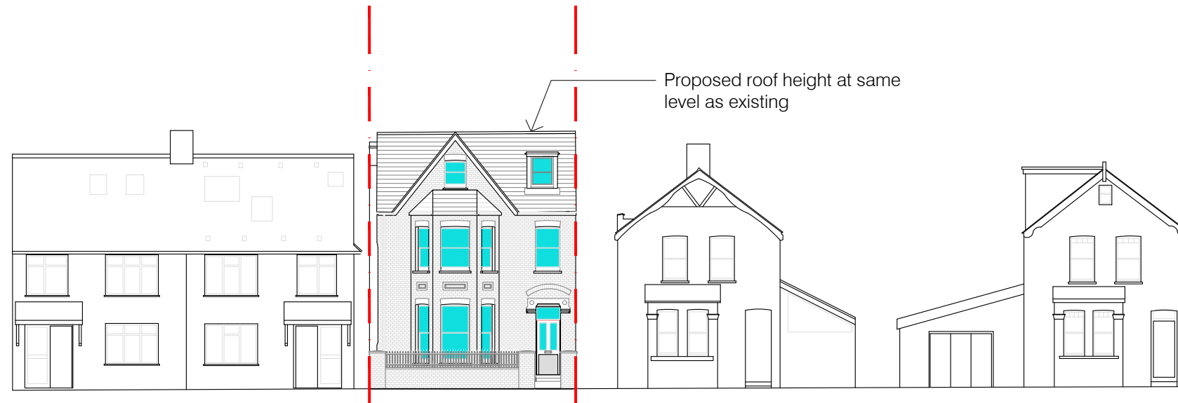
81-89 Connaught Road Street Scene

This drawing is the property of Mark Smith Architects Limited. Copyright is reserved. This drawing is issued on the condition that it is not retained by any unauthorised person. It may not be reproduced or disclosed or used, either wholly or in part without written consent of Mark Smith Architects Limited.