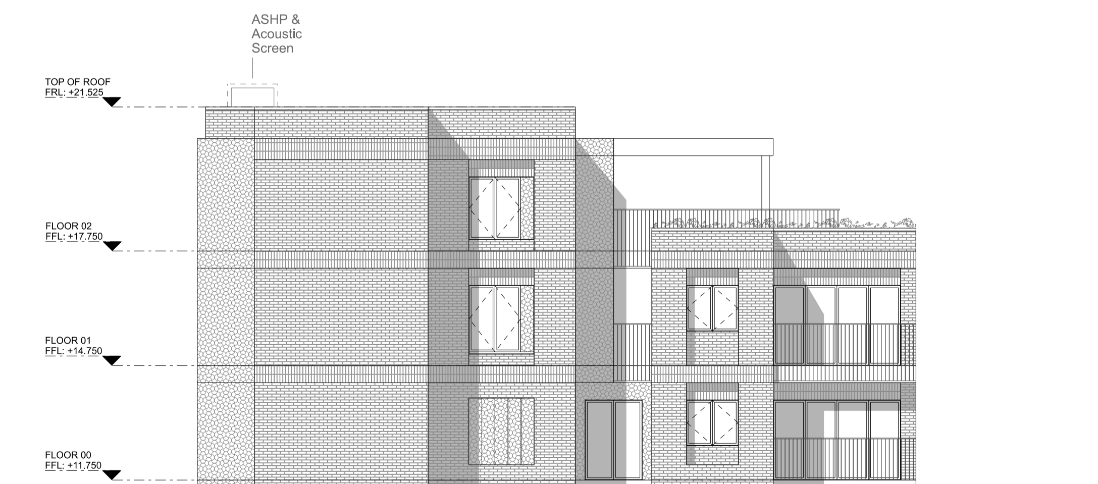
03 Block C: South Elevation 04121 SCALE 1:100