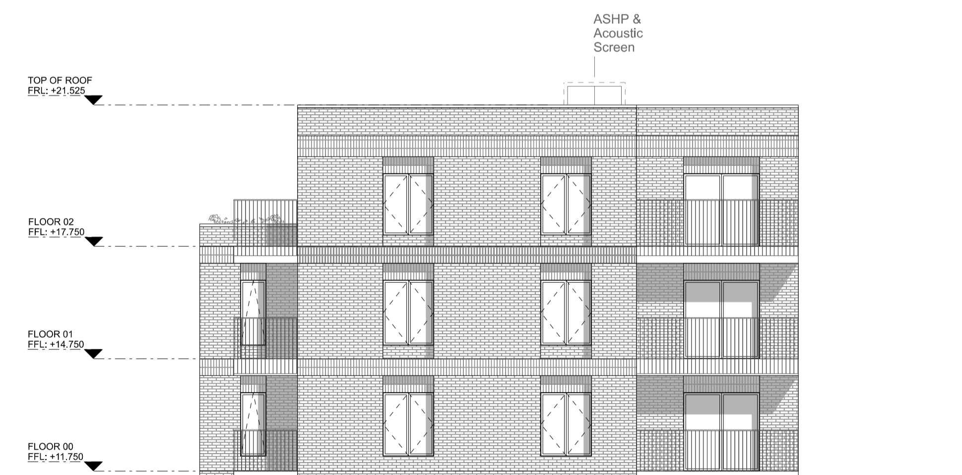
04 Block C: West Elevation 04121 SCALE 1:100