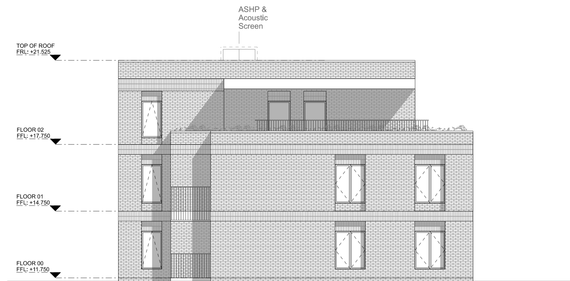
02 Block C: East Elevation 04121 SCALE 1:100