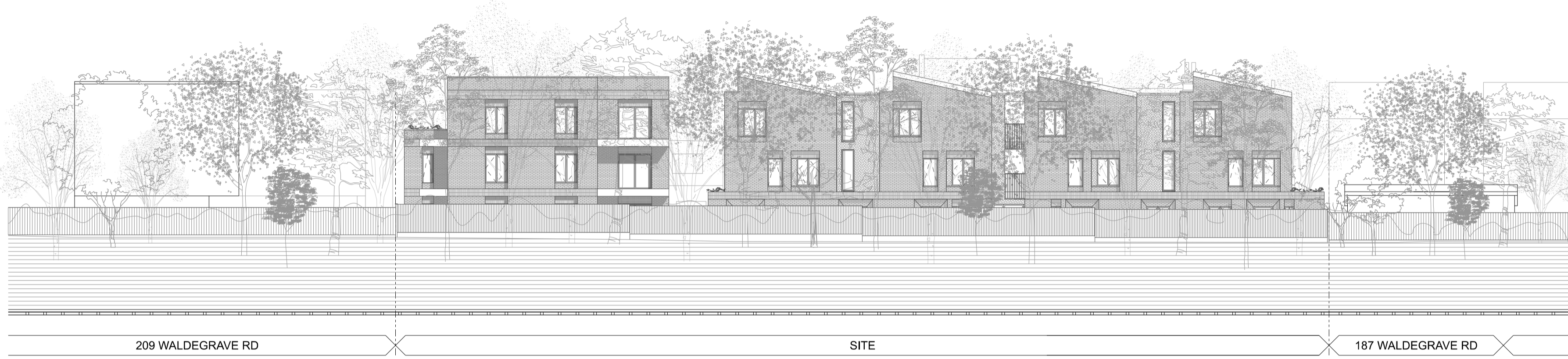
02 Proposed Site Elevation 02 01111 SCALE 1:250