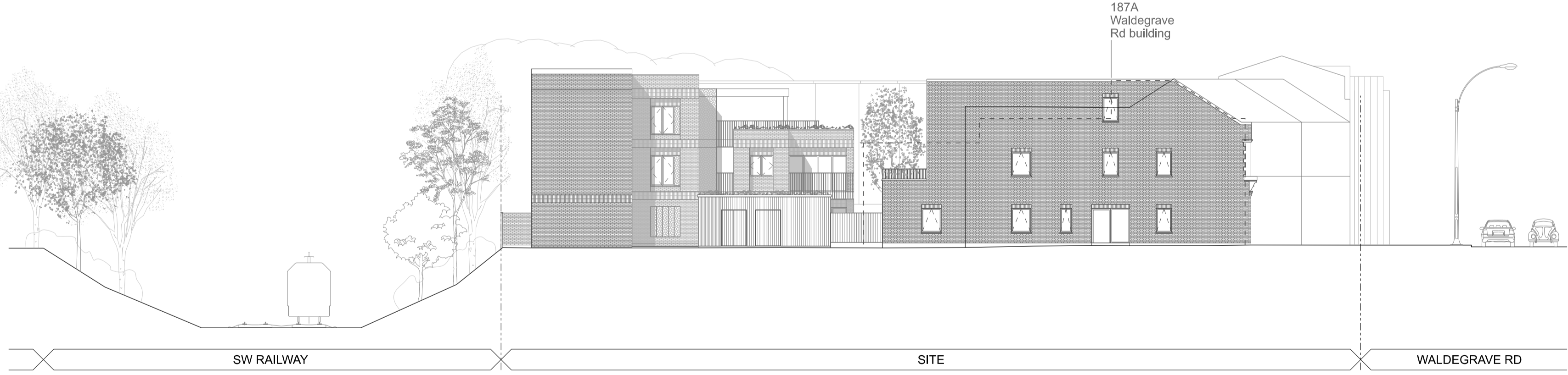
03 Proposed Site Elevation 03 01111 SCALE 1:250