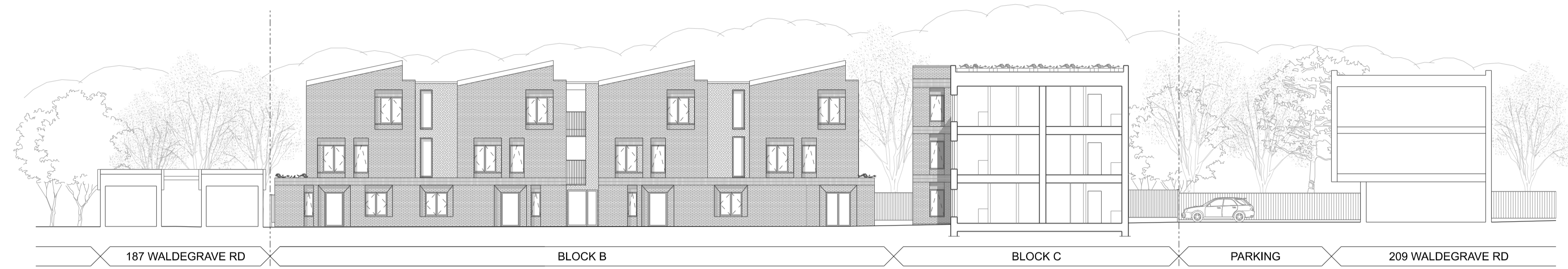
01 Proposed Site Section AA 01121 1:250 @A1