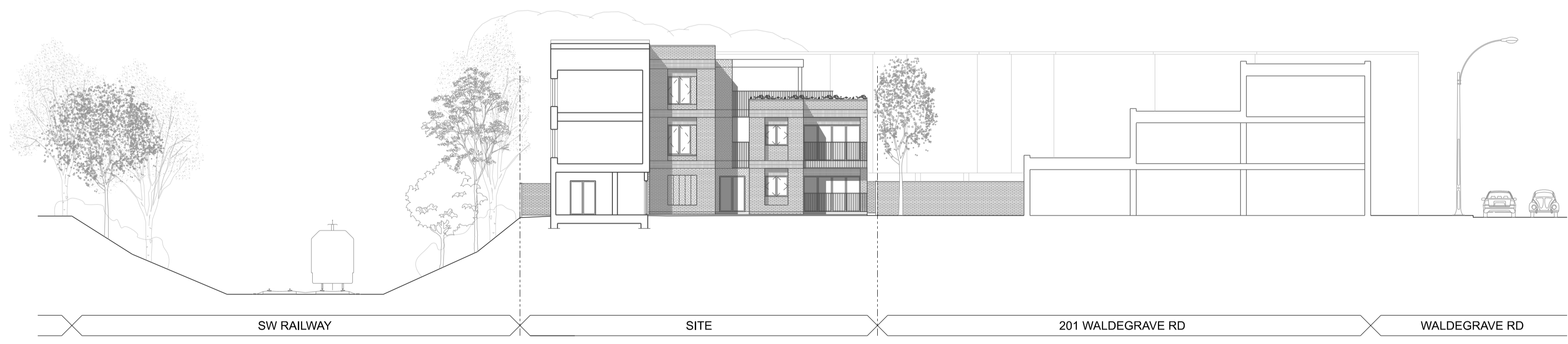
02 Proposed Site Section BB 01121 1:250 @A1