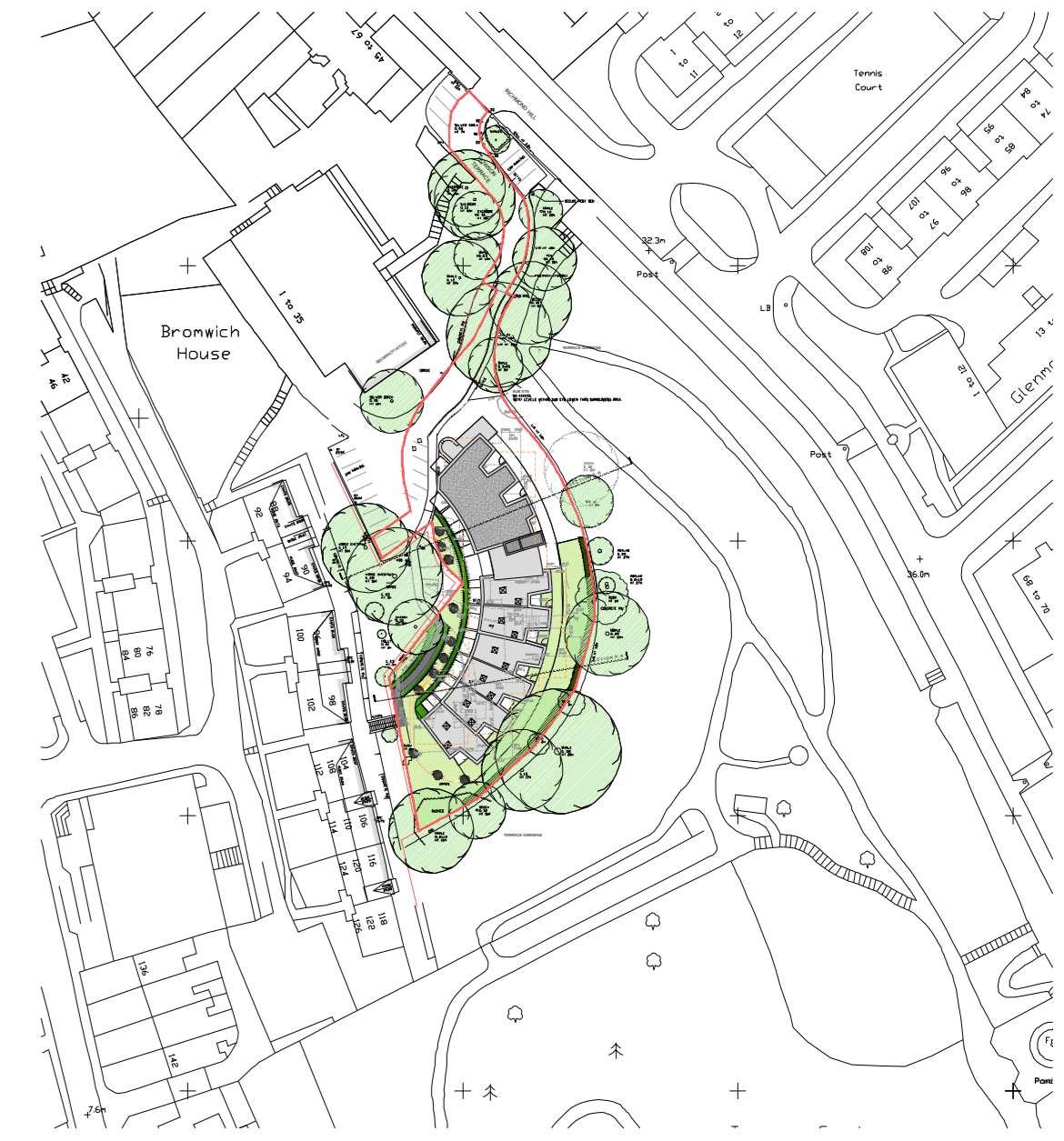
SITE LOCATION PLAN scale 1:1250@A0