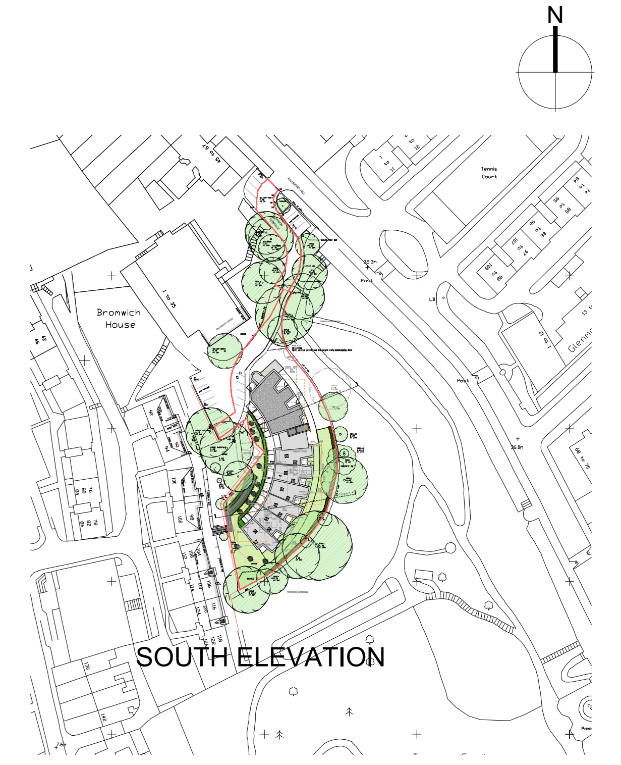
SITE LOCATION PLAN scale 1:1250@A0