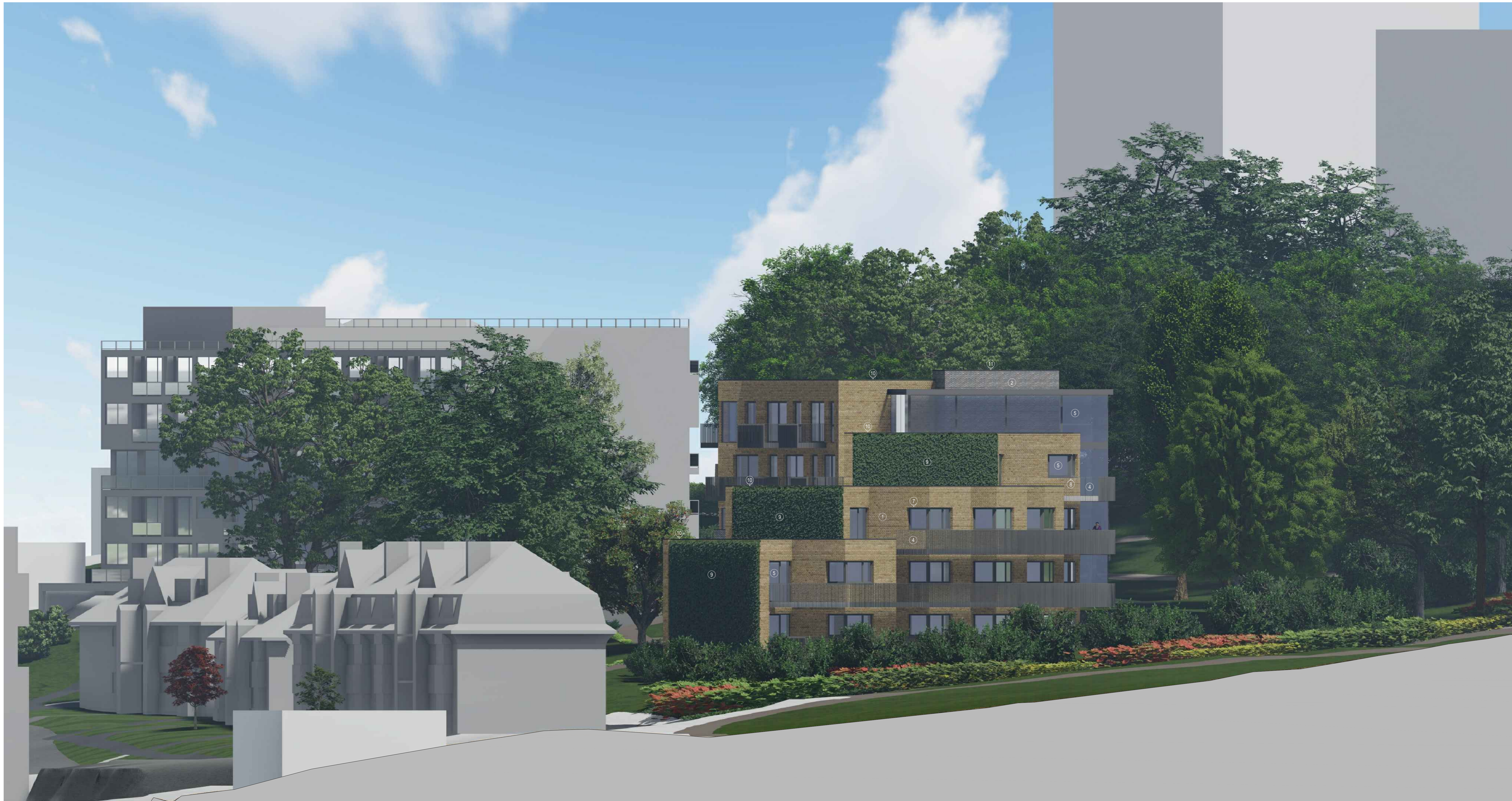
SOUTH ELEVATION scale 1:100@A0