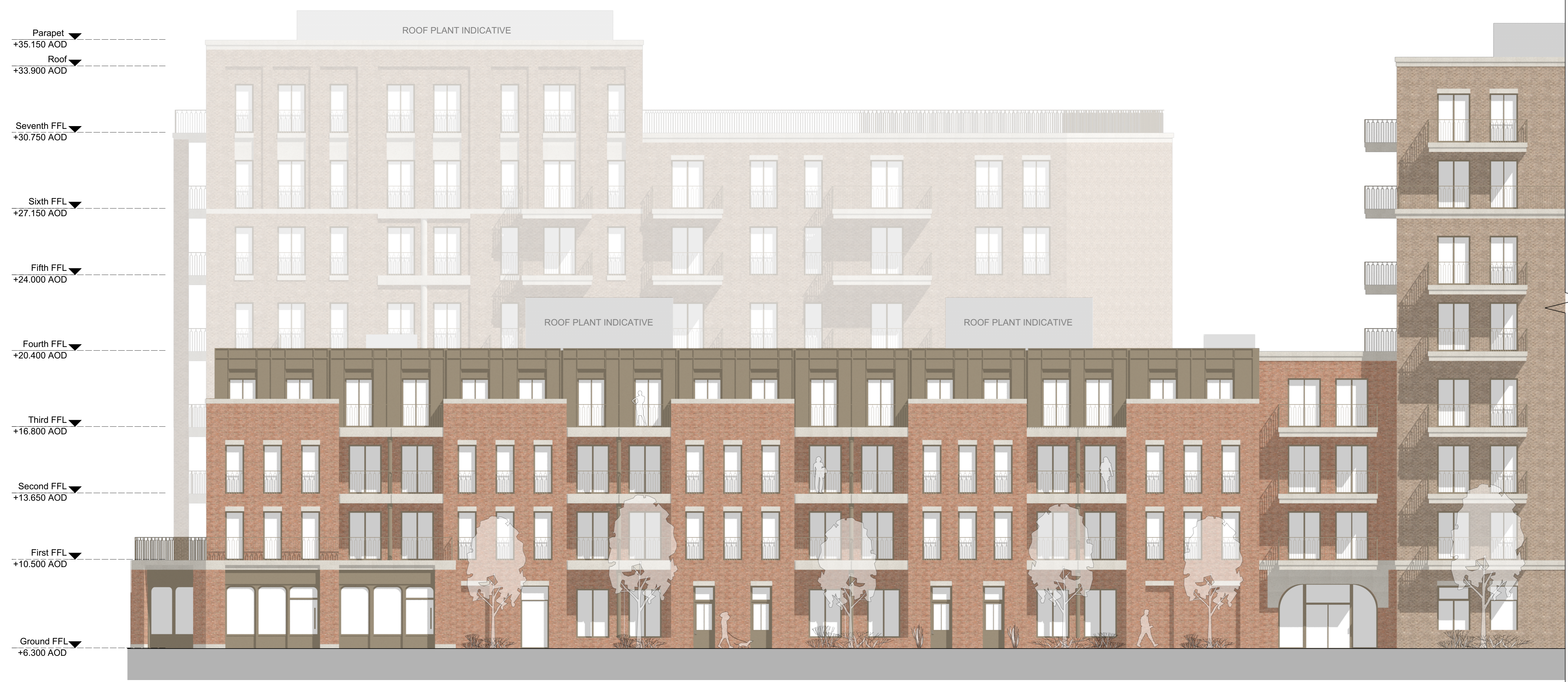
2 Block A East Elevation Scale: 1:100

Assael Architecture Limited 123 Upper Richmond Road London SW15 2TL +44 (0)20 7736 7744 info@assael.co.uk www.assael.co.uk