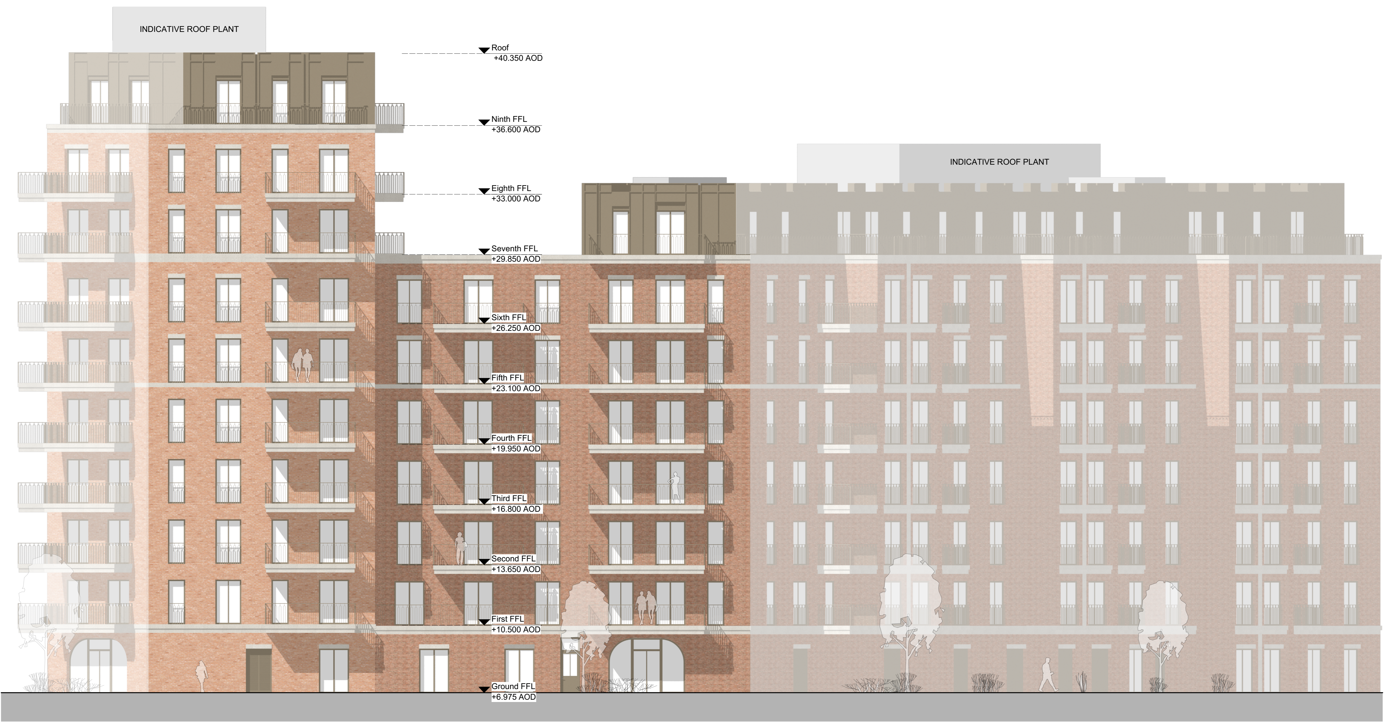
1 Block C North Elevation Scale: 1:100