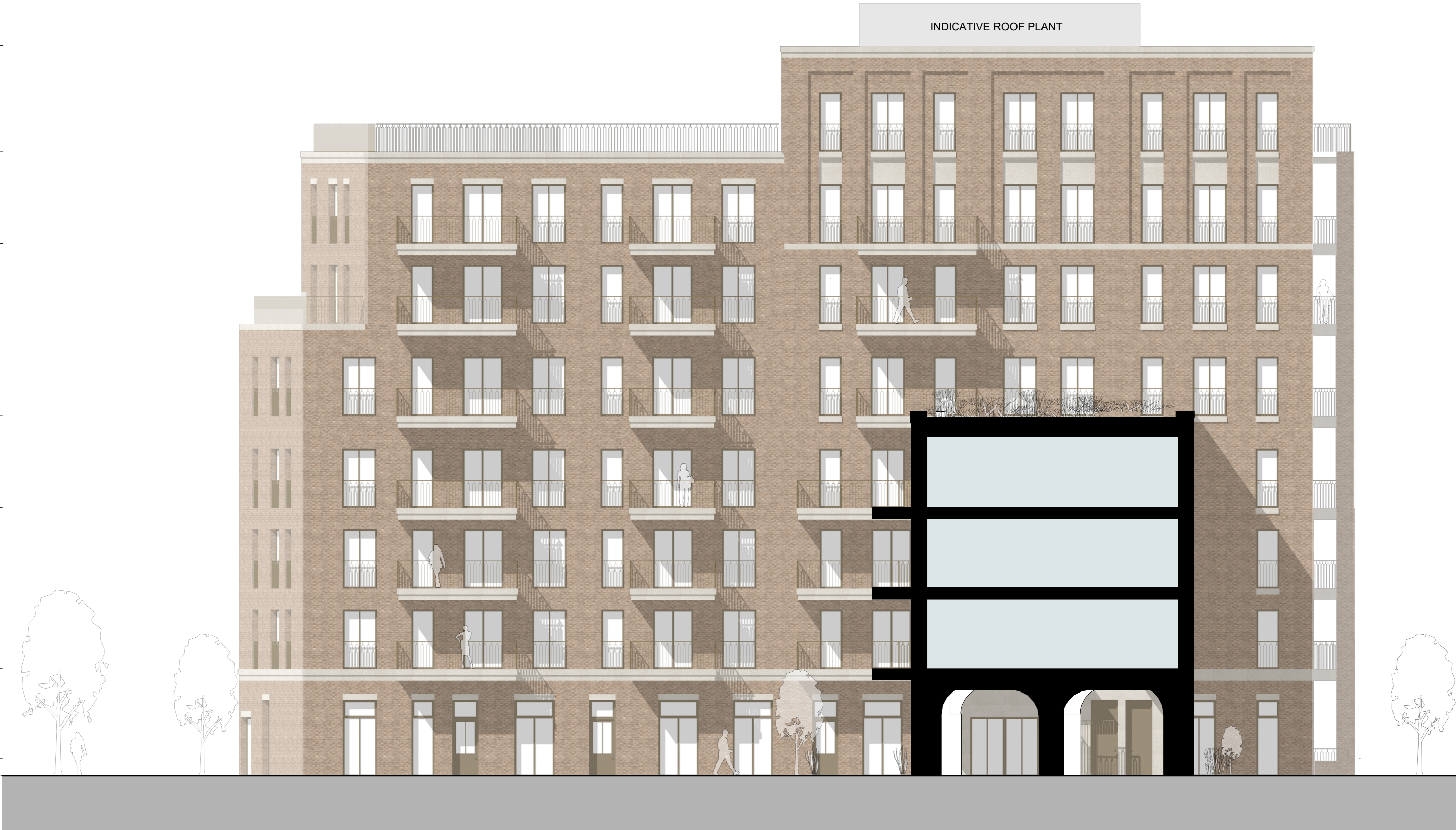
6 Block D East Internal Courtyard Elevation Scale: 1:100

Parapet +43.300 AOD Roof +33.300 AOD Seventh FFL +30.150 AOD Sixth FFL +26.700 AOD Fifth FFL +23.550 AOD Fourth FFL +20.400 AOD Third FFL +16.800 AOD Second FFL +13.650 AOD First FFL +10.500 AOD Ground FFL +6.975 AOD Commercial FFL +6.300 AOD