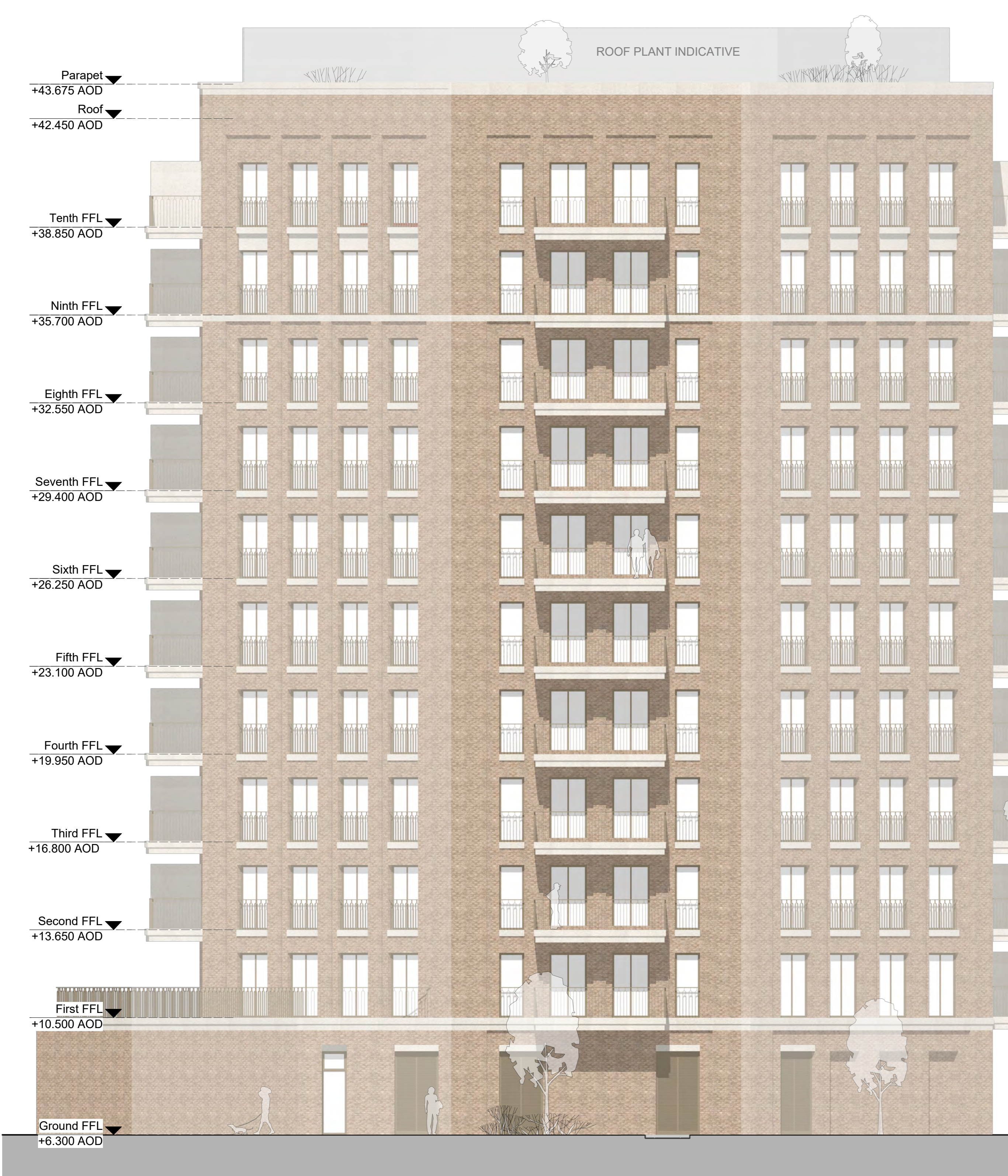
7 Block B North West Elevation Scale: 1:100