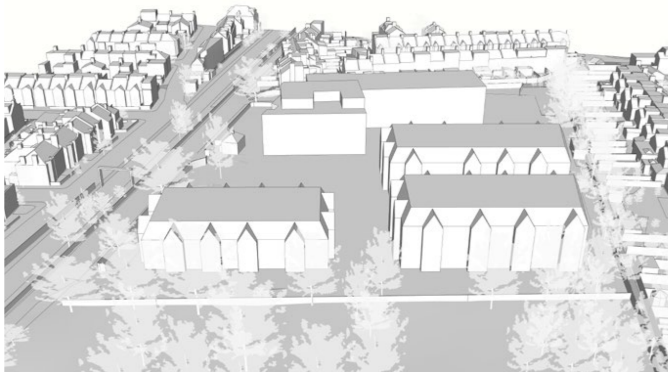
Block A - 3 storey option