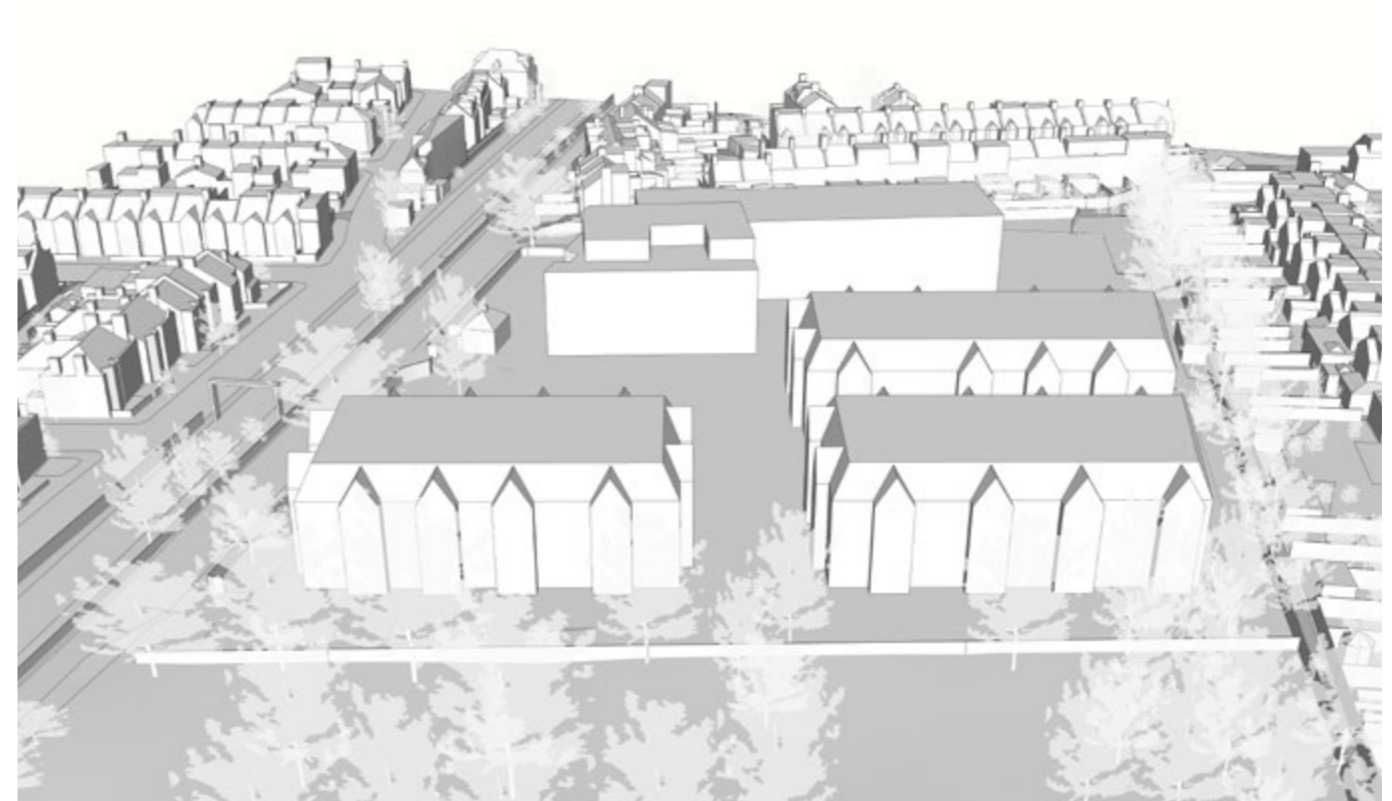
Block A - 4 storey option

Following the council comment different options were explored in relation to Block A height. The options are presented on this page. The three storey option was adopted for future development.