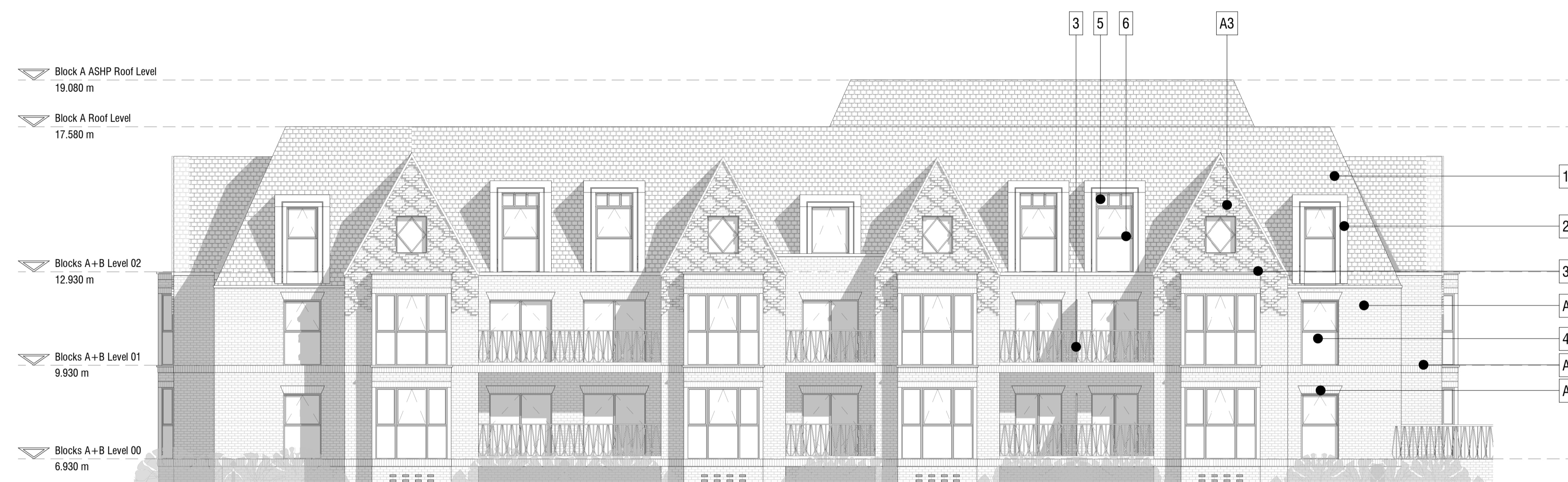
2 Block A Elevation 2 1:100