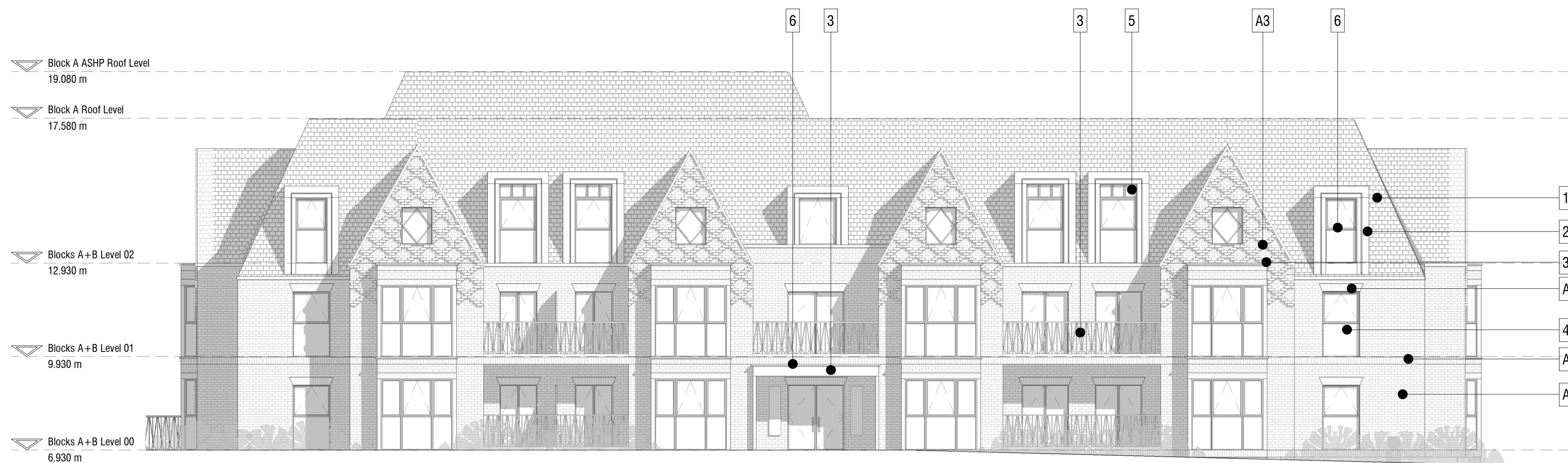
1 Block A Elevation 1 1:100