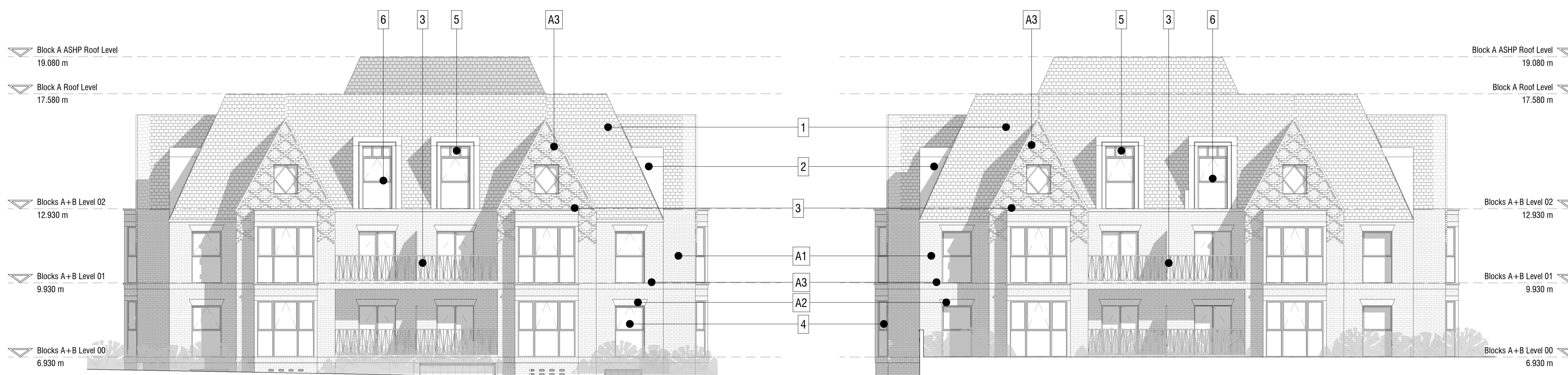
3 Block A Elevation 3 1:100