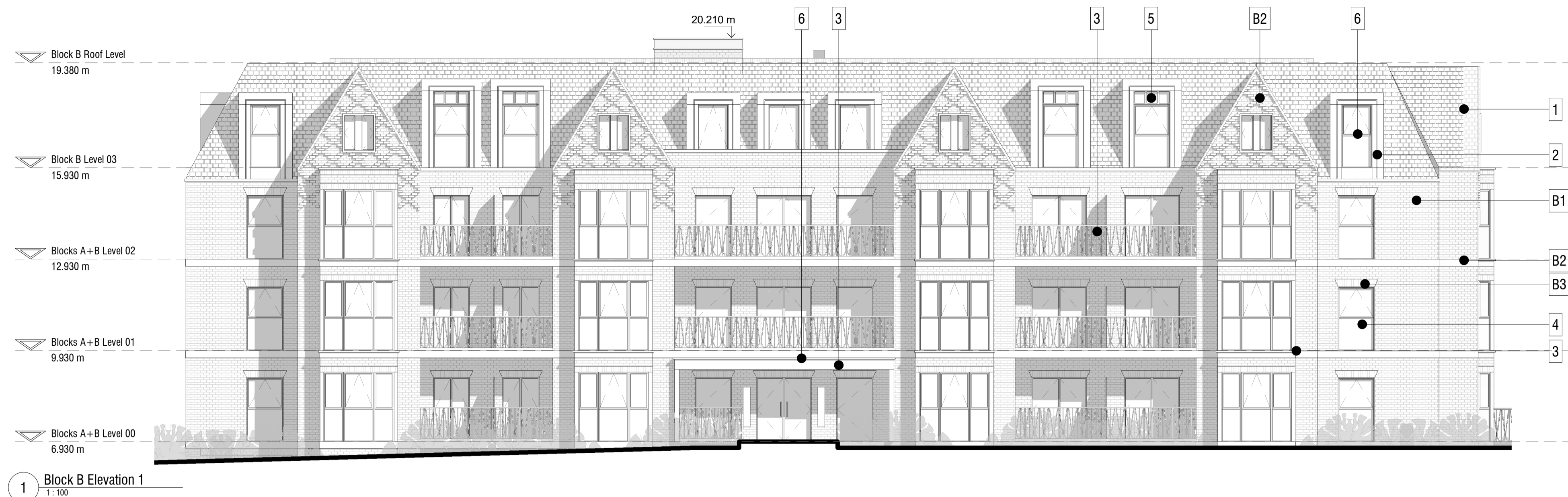
1 Block B Elevation 1 1:100