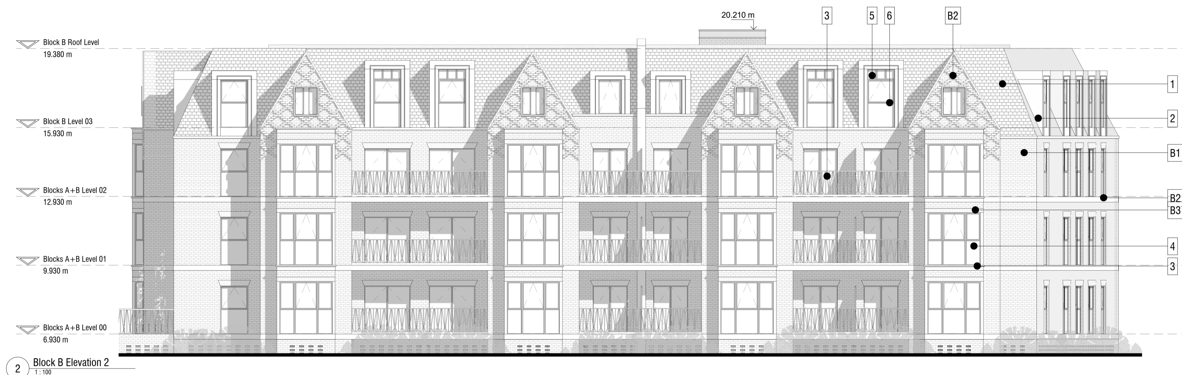
2 Block B Elevation 2 1:100