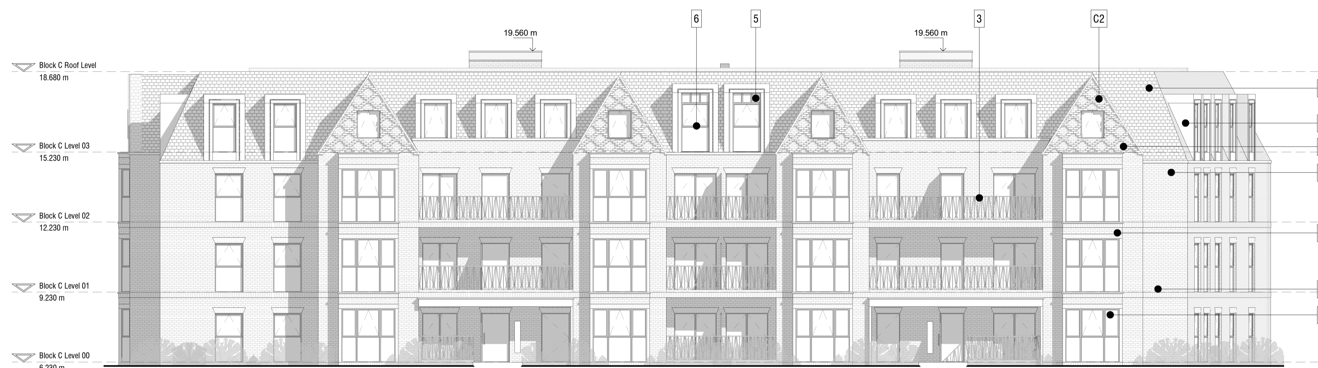
2 Block C Elevation 2 1:100