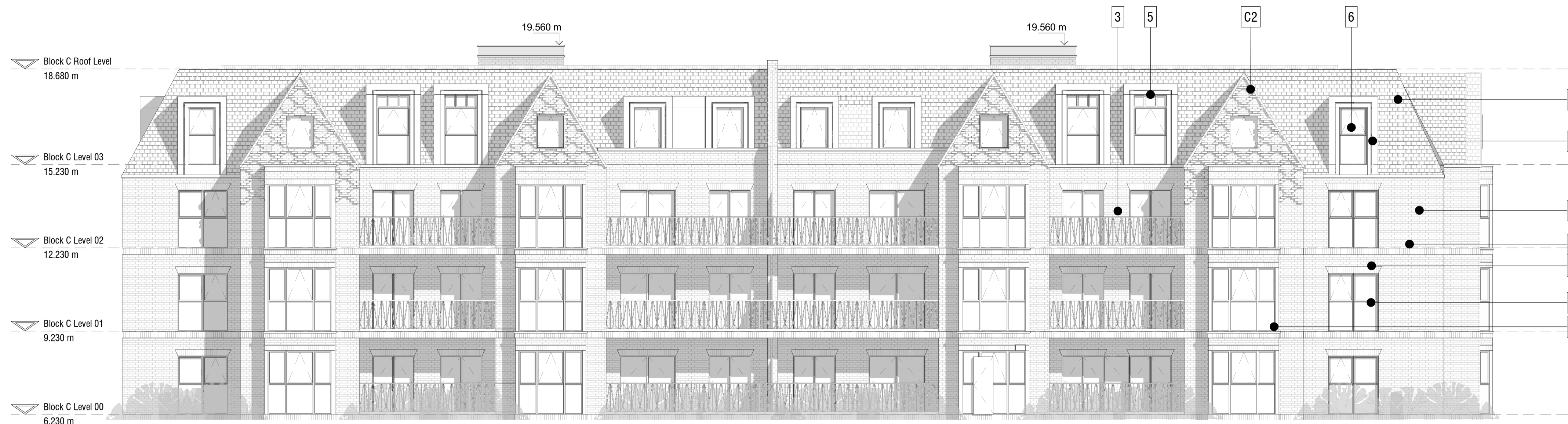
1 Block C Elevation 1 1:100