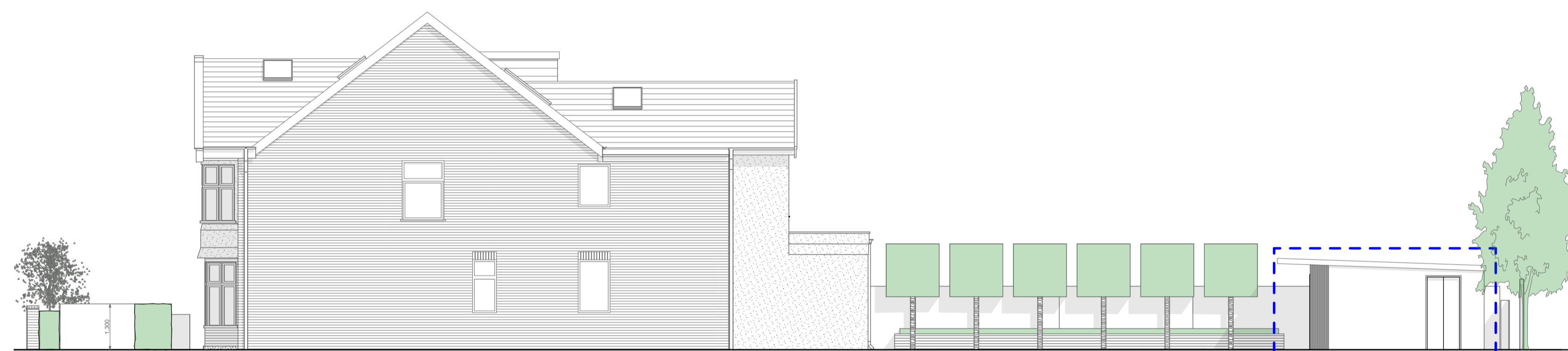
Flank 1 Elevation