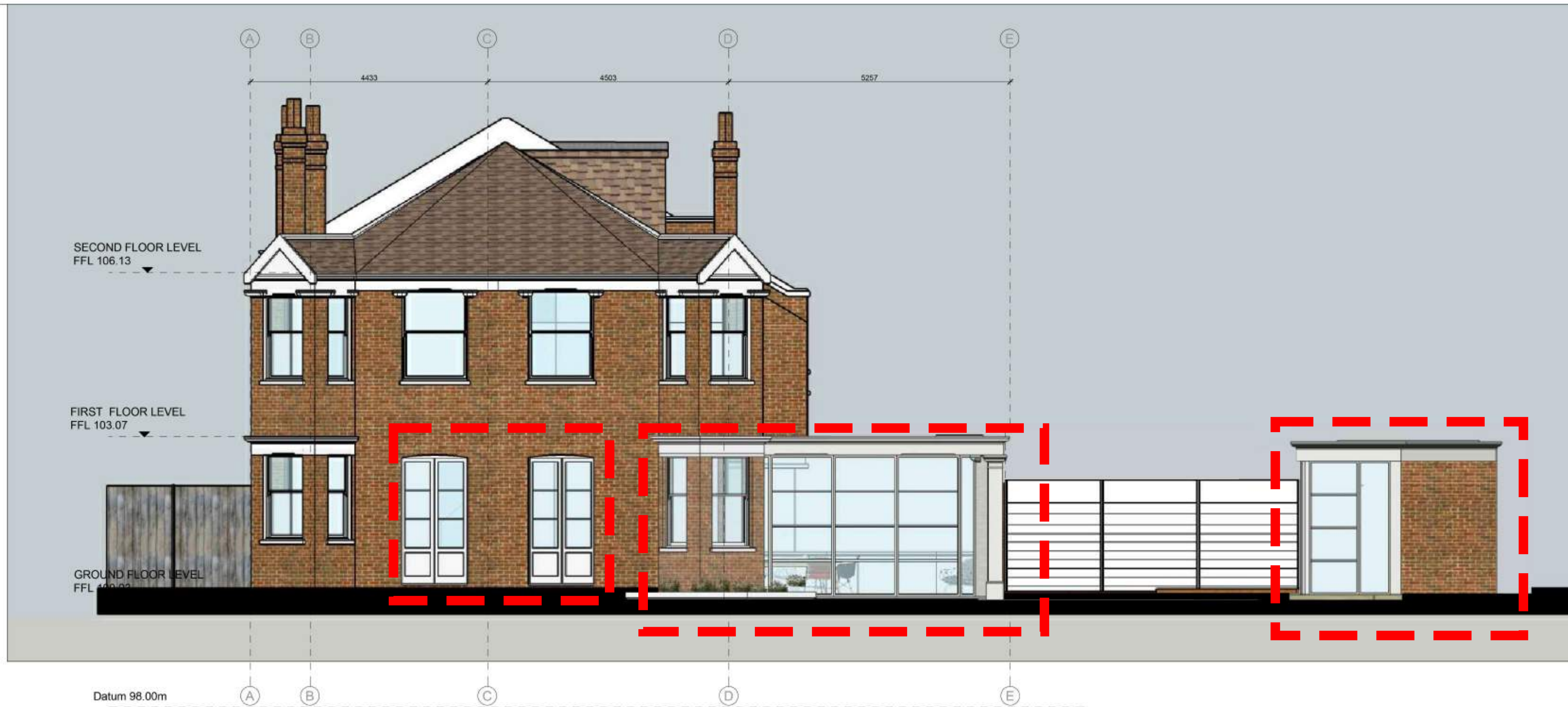
SIDE ELEVATION PROPOSED