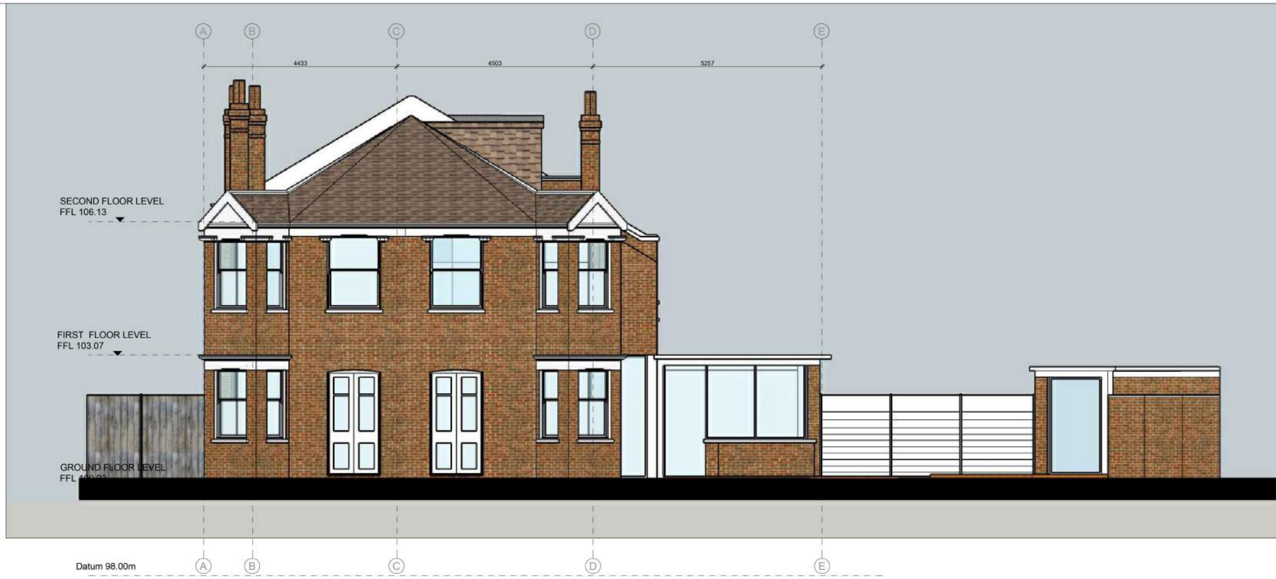
SIDE ELEVATION APPROVED