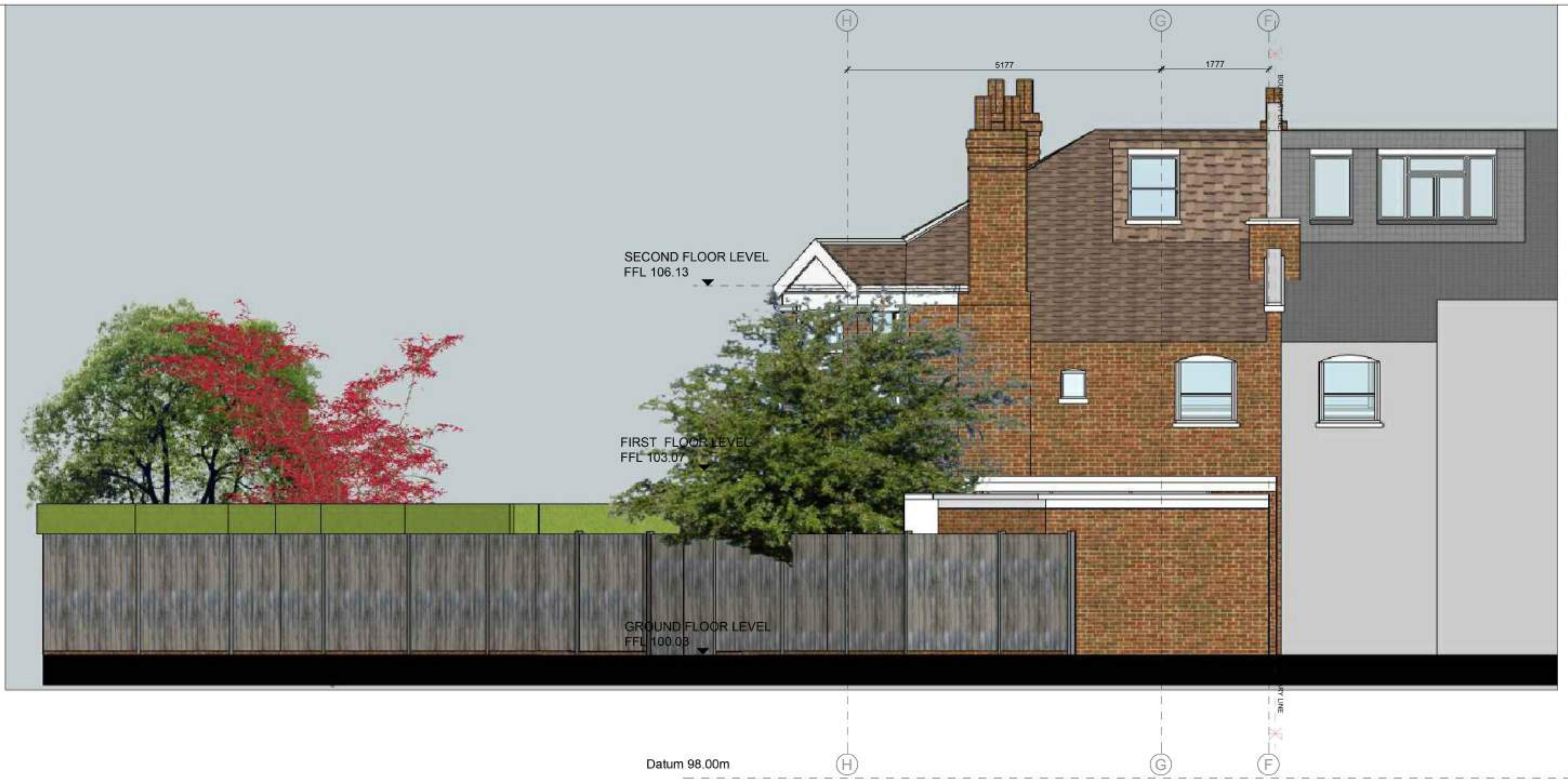
REAR ELEVATION APPROVED