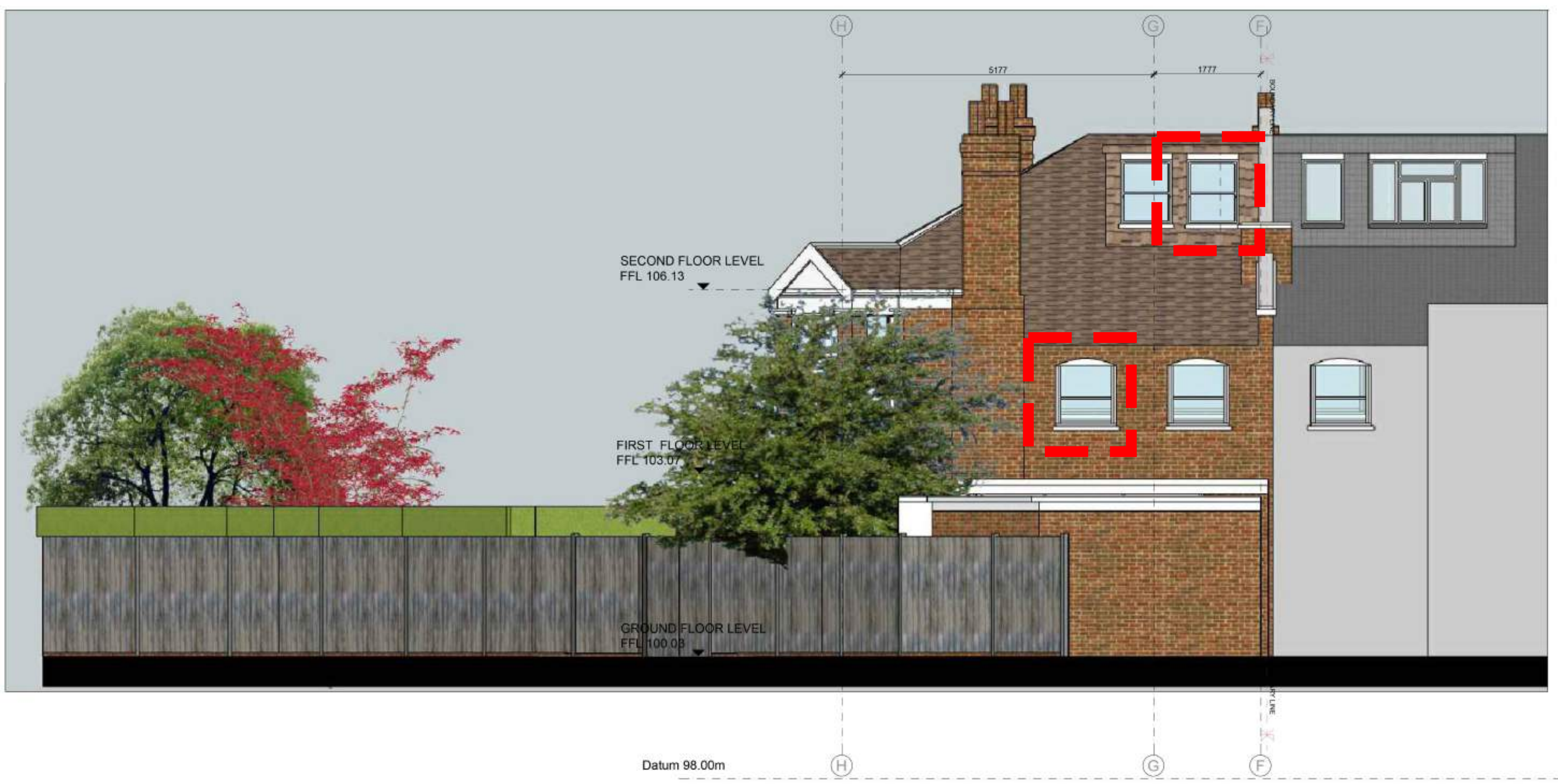
REAR ELEVATION PROPOSED