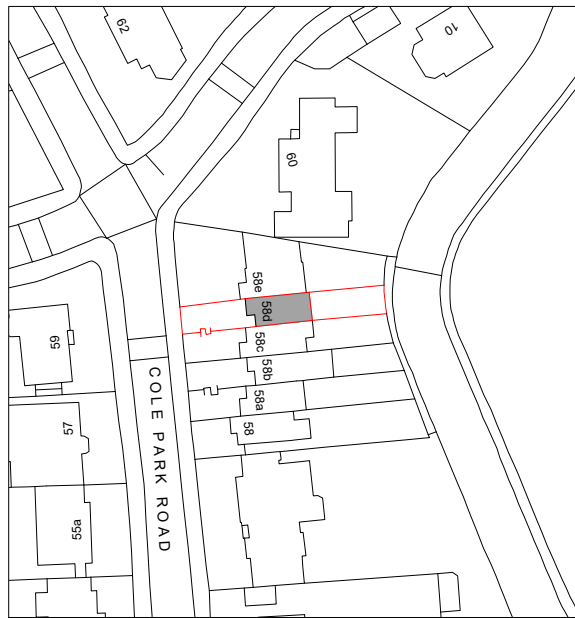
Existing Location Plan 1:1250 @ A3