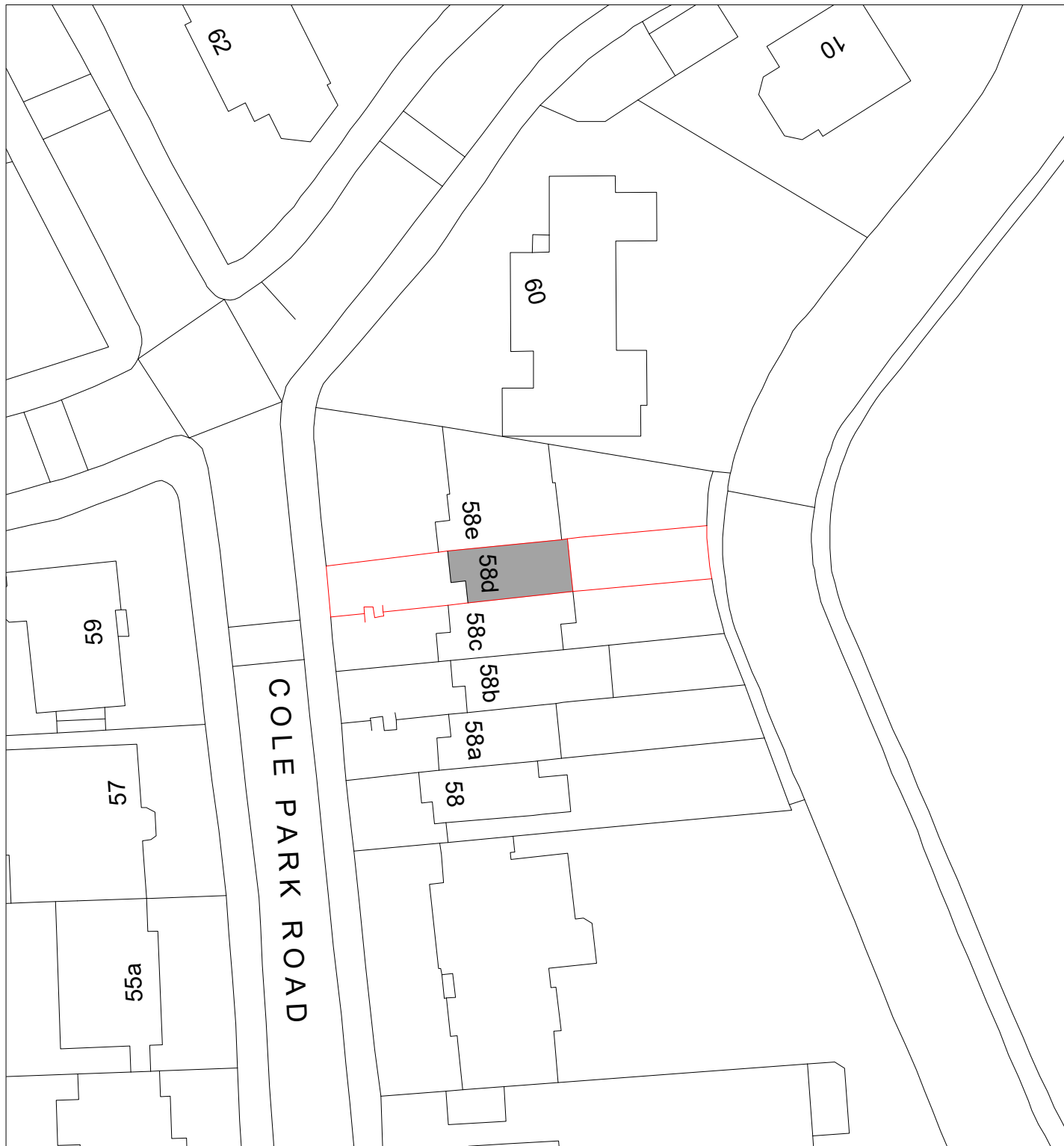
Existing Site Plan 1:200 @ A3