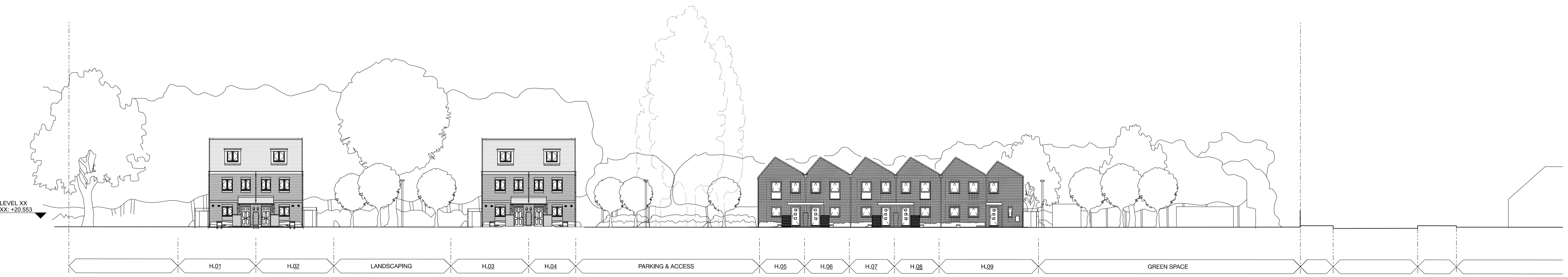
01 Proposed Site Elevation 01 01401 SCALE 1:500 @A3