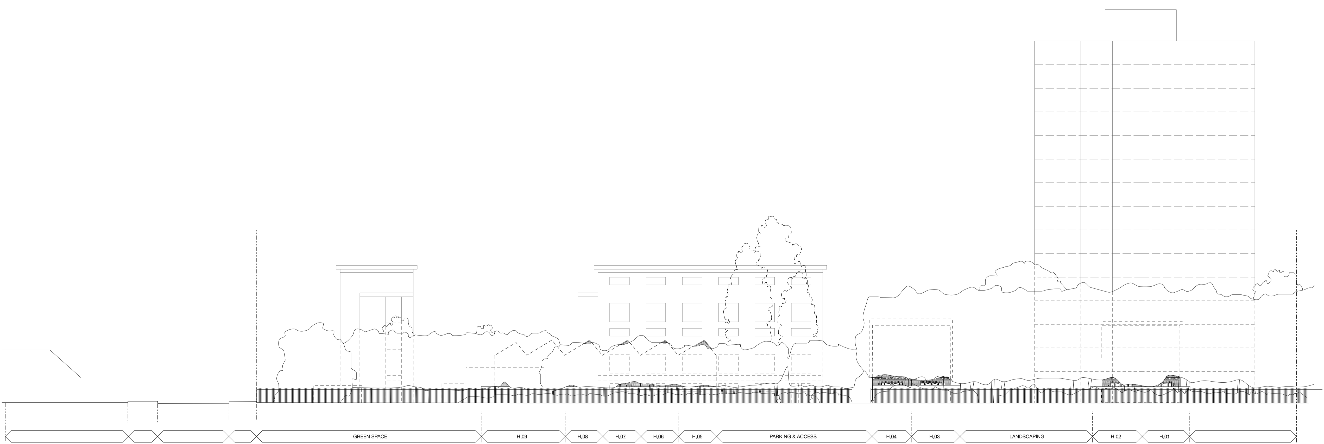
02 Proposed Site Elevation 02 01401 SCALE 1:500 @A3