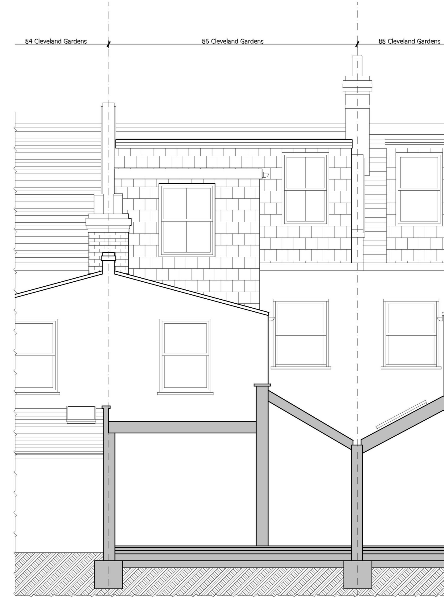
3 Existing Section