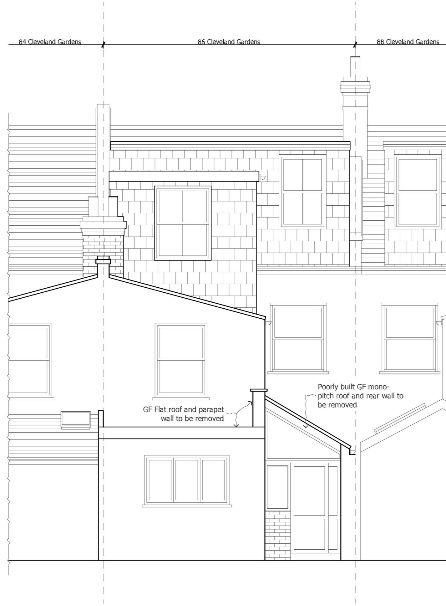
2 Existing Rear Elevation