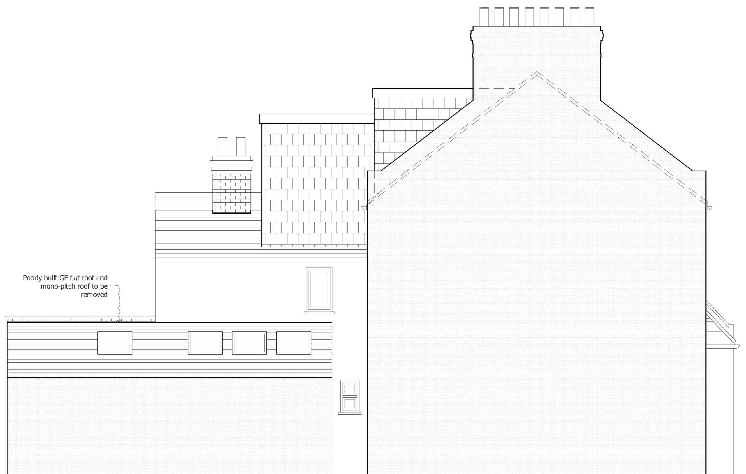
4 Existing Side Elevation