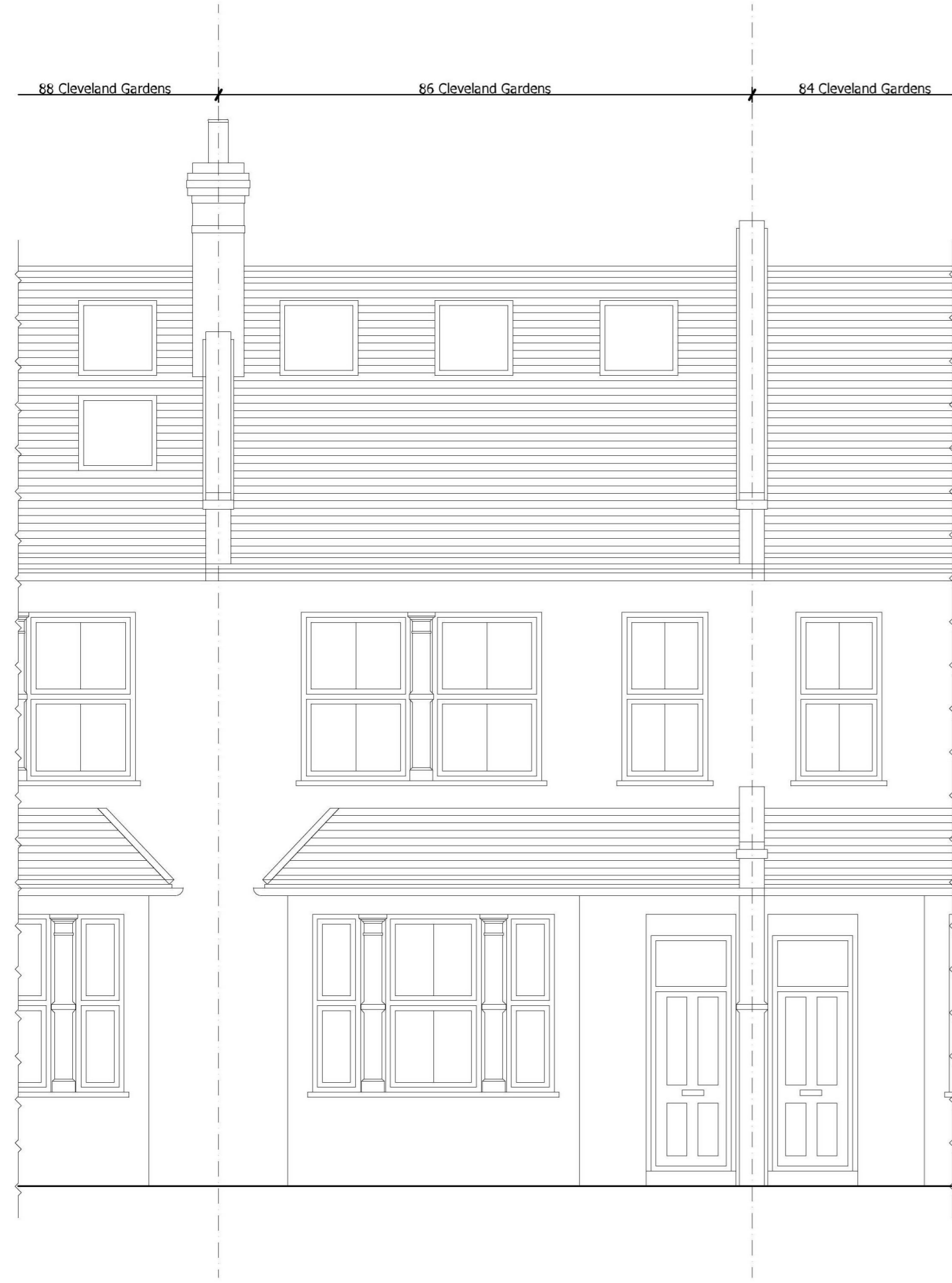
1 Existing Front Elevation