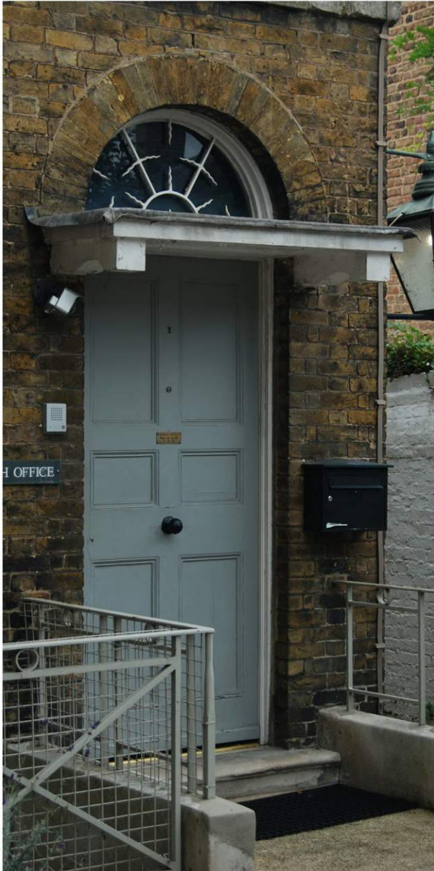
Photographs taken on 23 September 2021