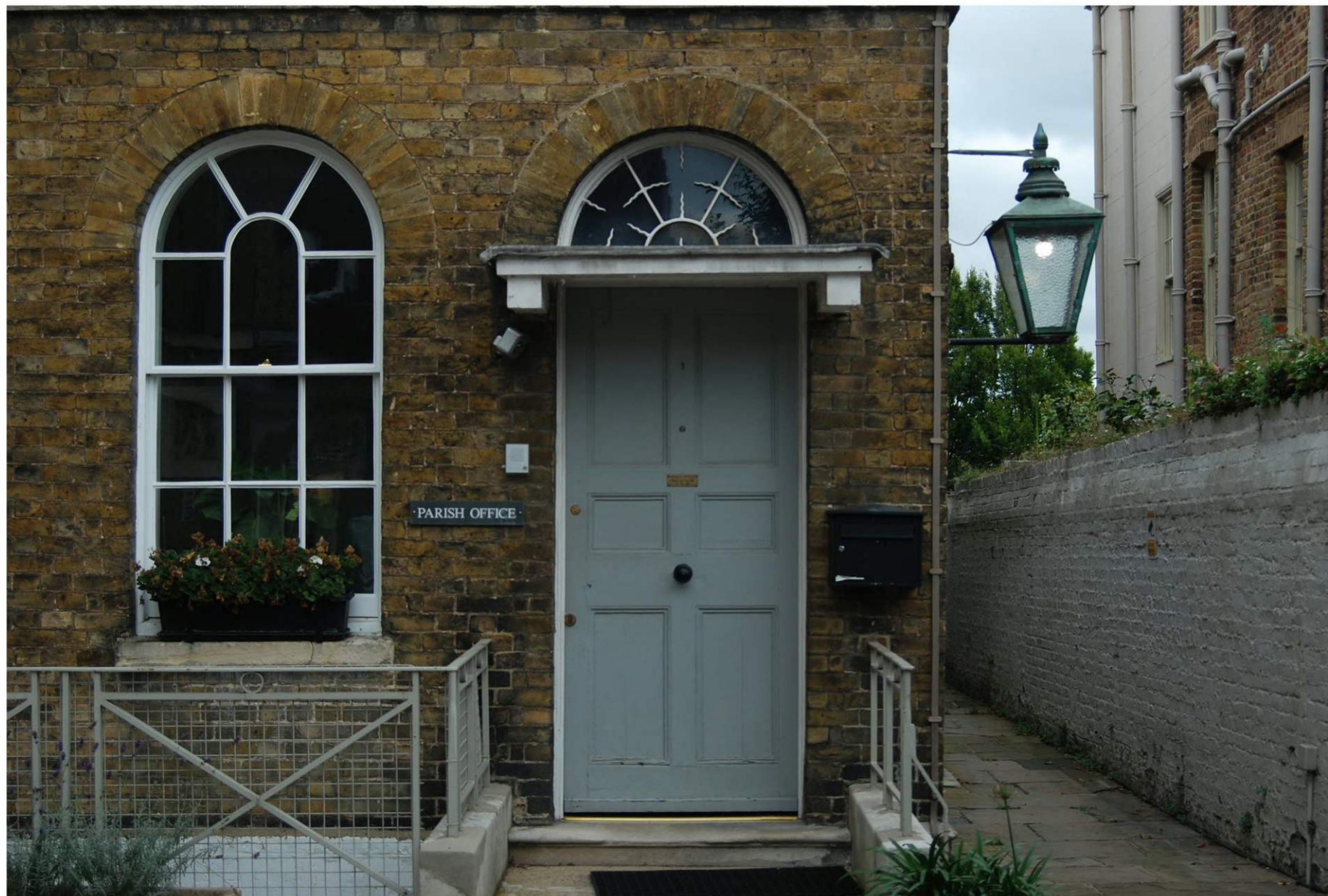
Photographs taken on 23 September 2021

Application 21/2148/FUL St Elizabeth of Portugal RC Church The Vineyard TW10 6AQ