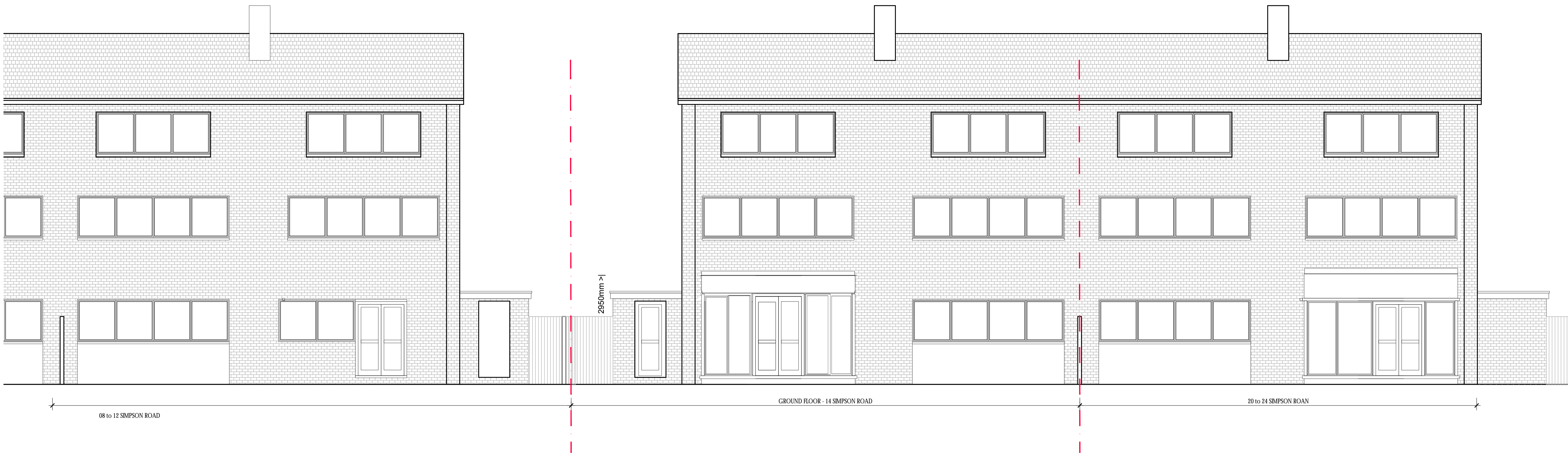
1 Proposed Rear (NORTH) Elevation