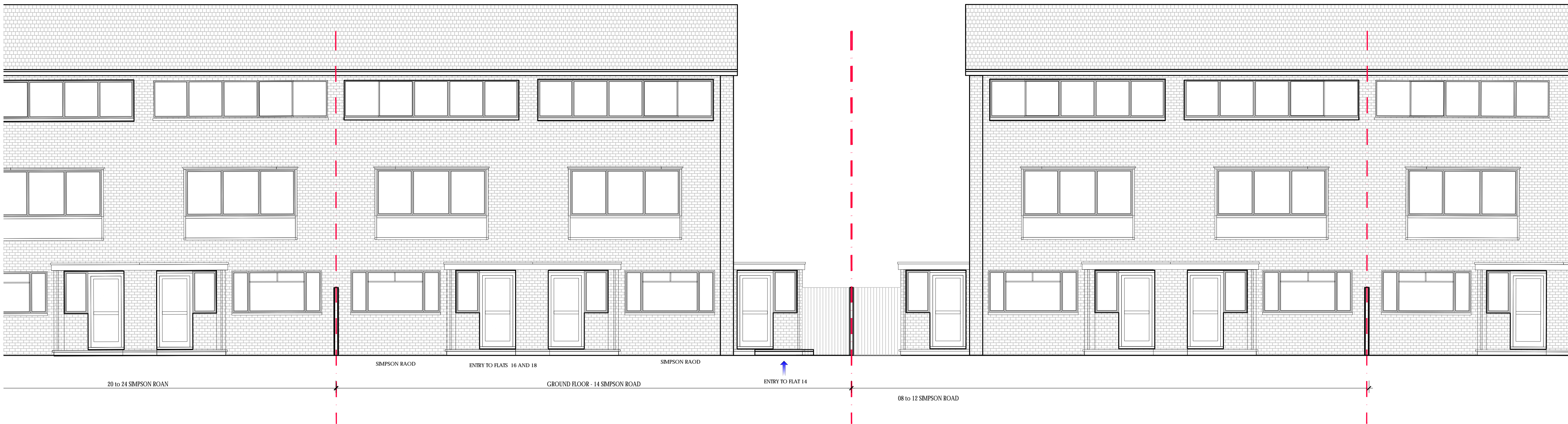
1 Existing Front (SOUTH) Elevation