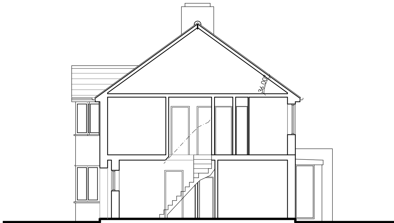
Existing Section A - A