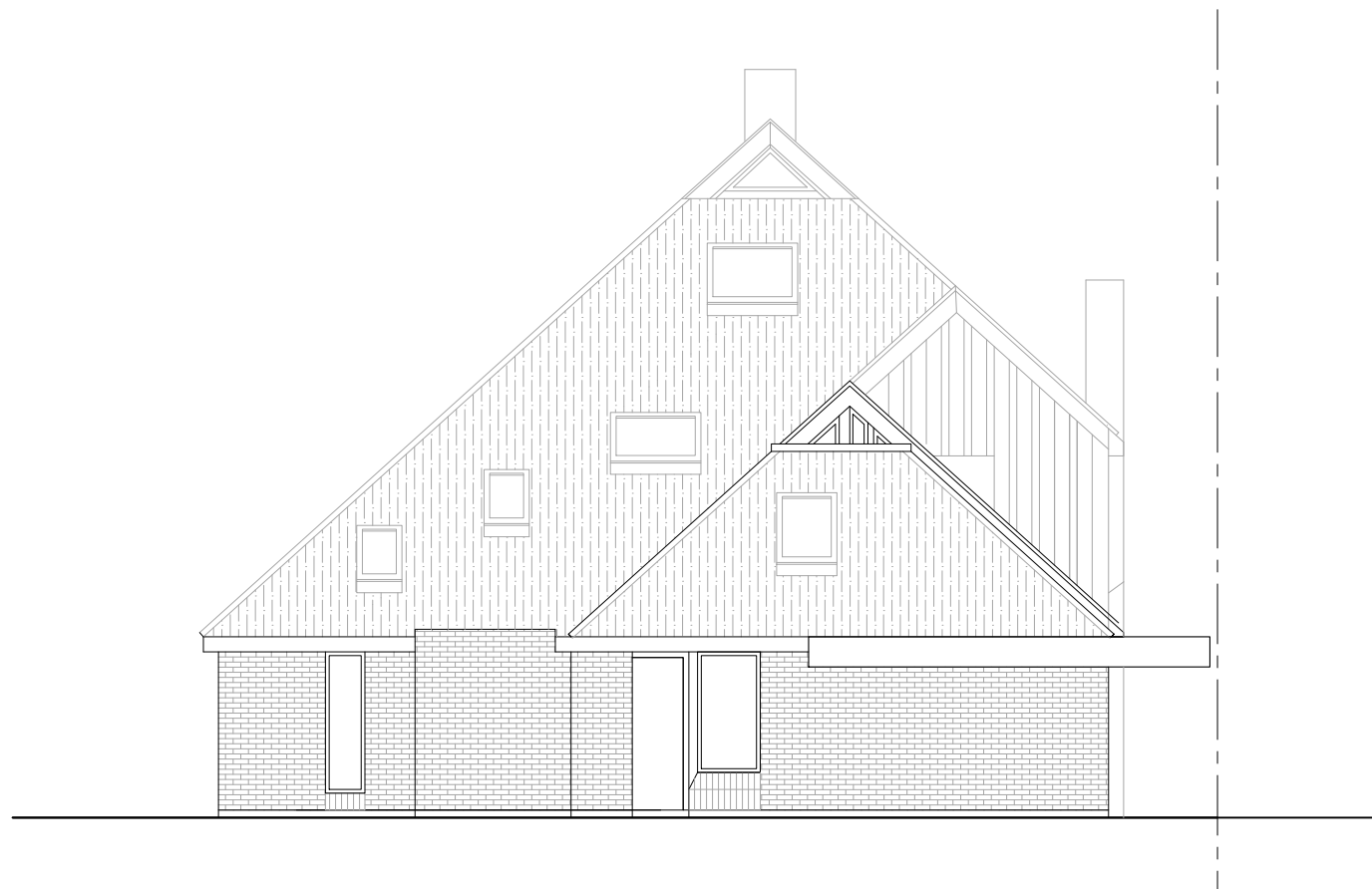
NORTH-EAST FACING ELEVATION AS EXISTING scale 1:100