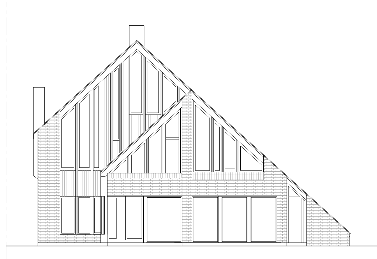
SOUTH-WEST FACING ELEVATION AS EXISTING scale 1:100