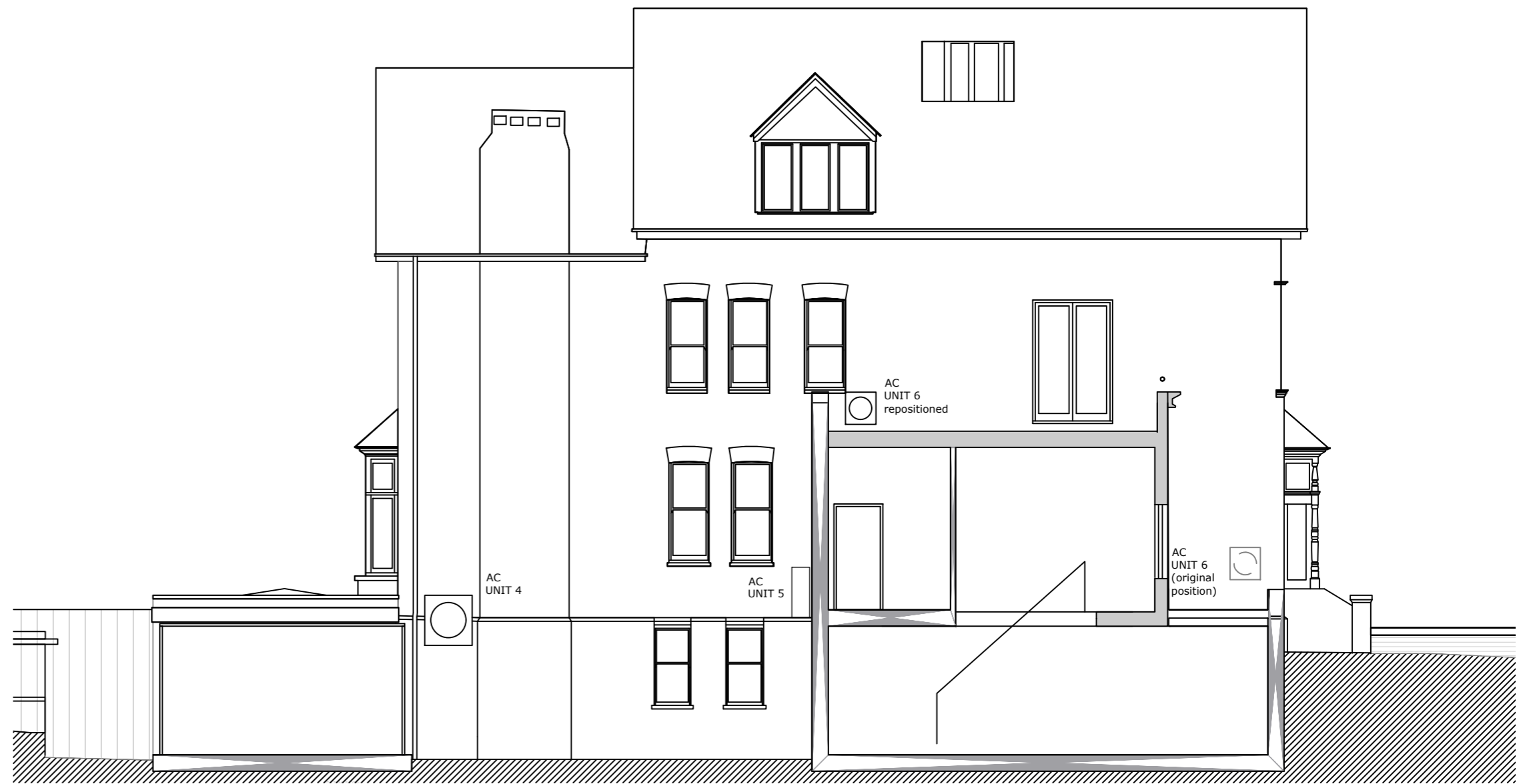
SIDE ELEVATION/SECTION 1