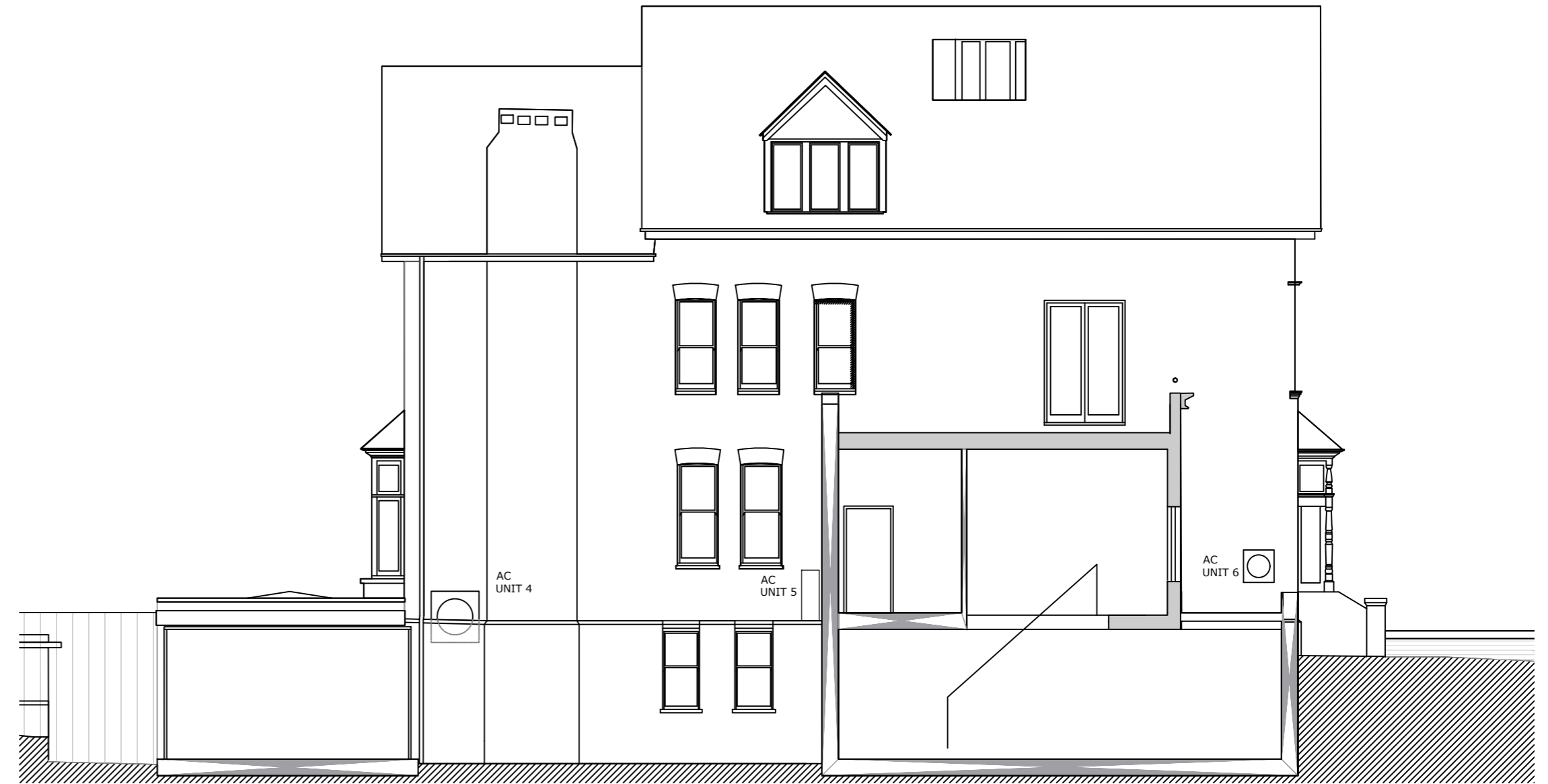
SIDE ELEVATION/SECTION 1