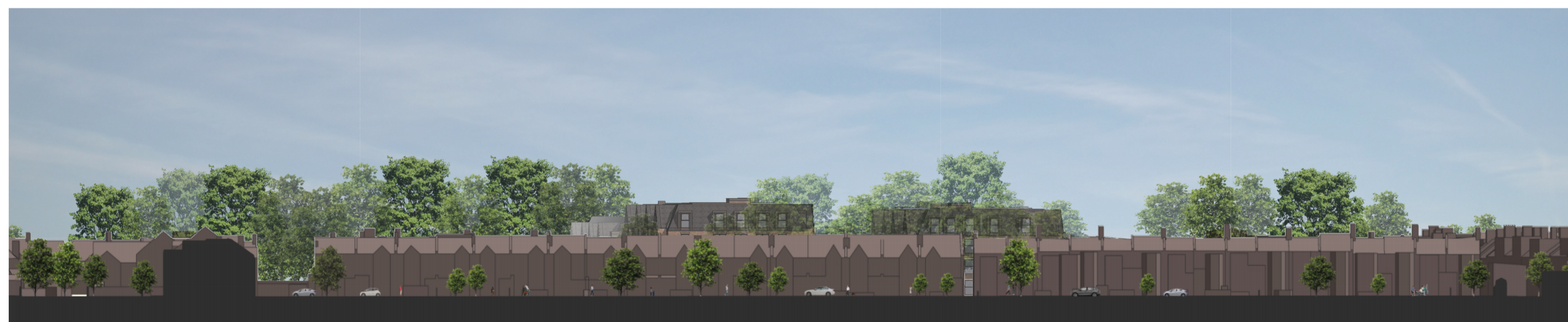
2 Elevation B - Grosvenor Avenue 1:500