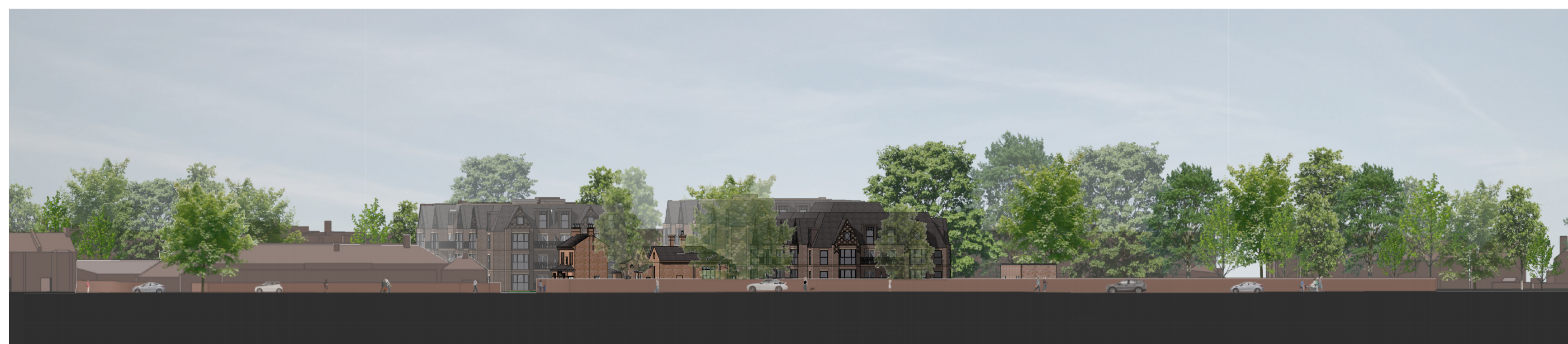
1 Elevation A - South Worple Way 1:500