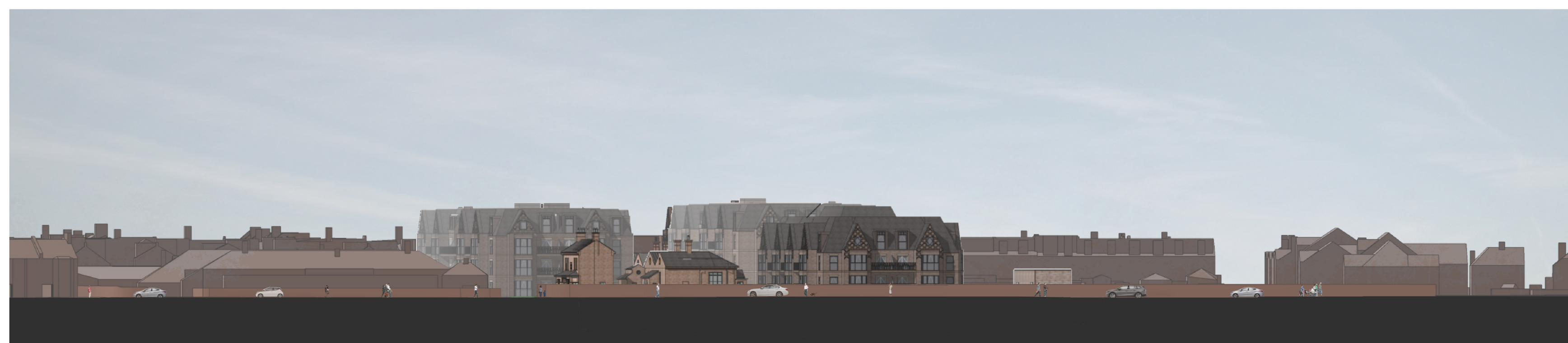
1 Elevation A _ South Worple Way 1 : 500