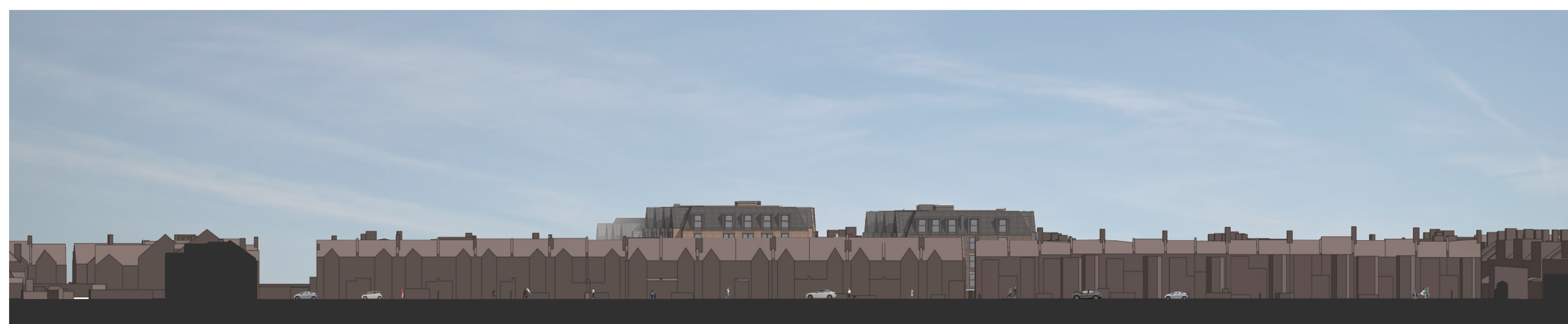
2 Elevation B _ Grosvenor Avenue 1 : 500