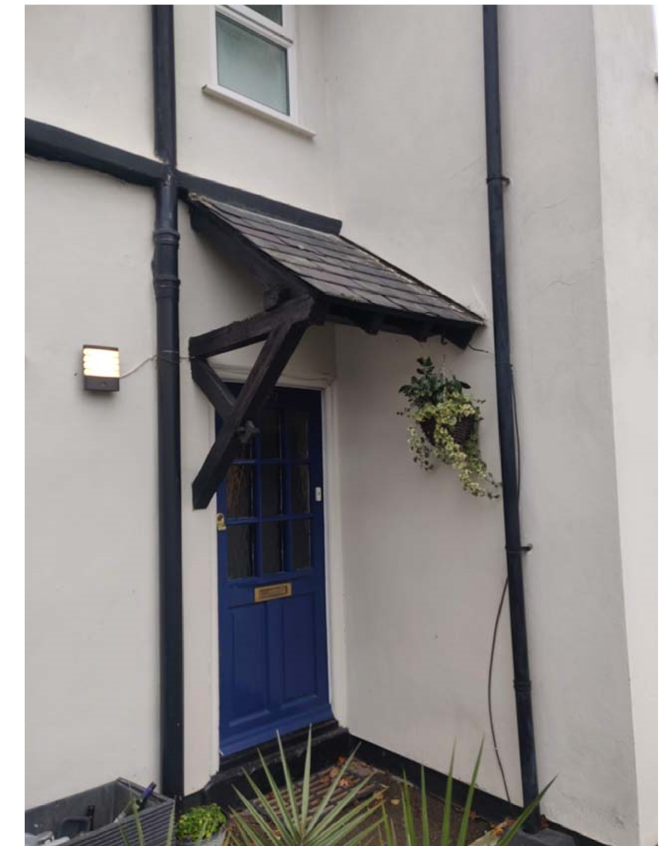
Example of existing porches on the same street