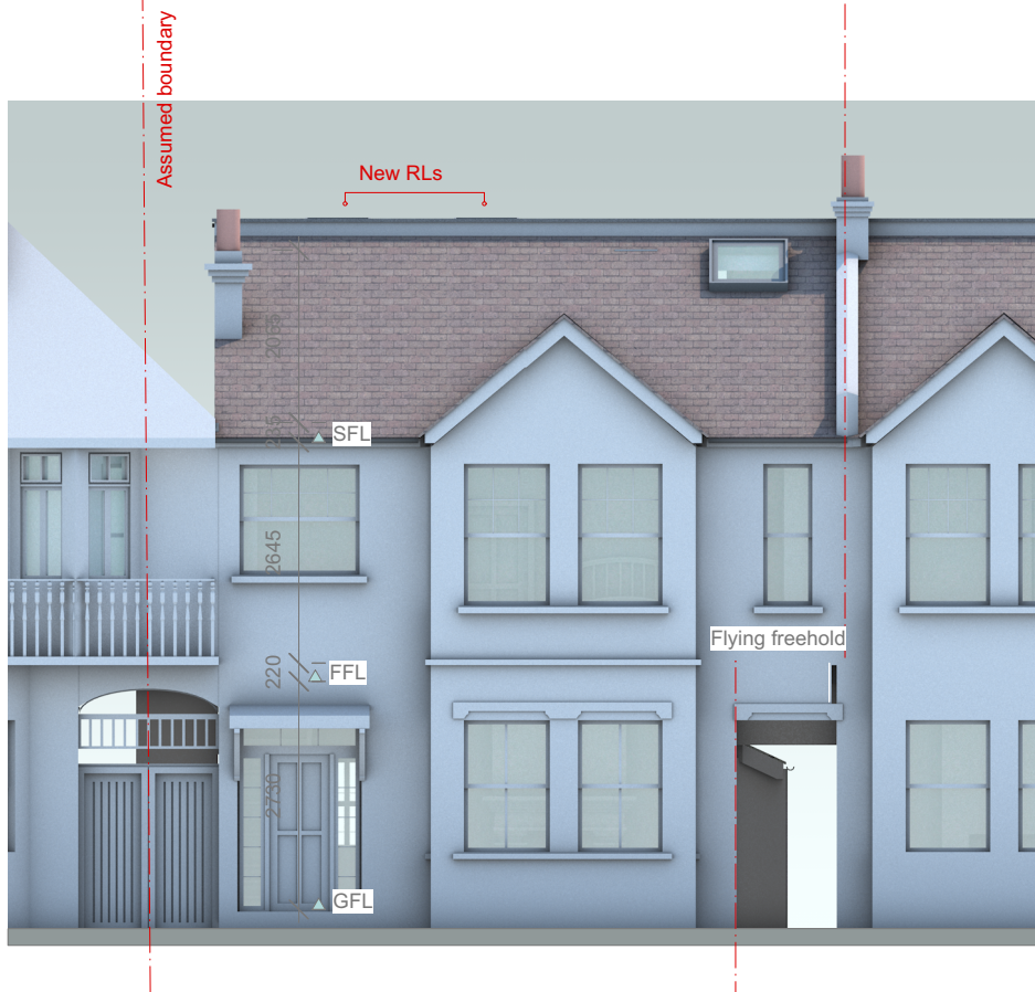
1 Front Elevation Scale: 1:100

GENERAL NOTES: Do not scale from this drawing. Dimensions must be checked on site. This drawing is copyright of Grainne O'Keeffe Architects. This drawing cannot be copied or used in any way without the express permission of Grainne O'Keeffe Architects. Neighbouring properties not surveyed unless stated