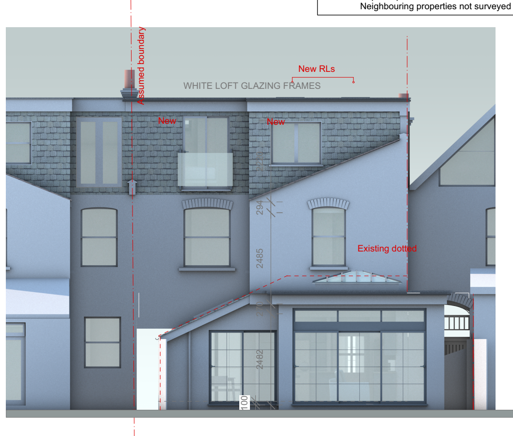
2 Rear Elevation Scale: 1:100