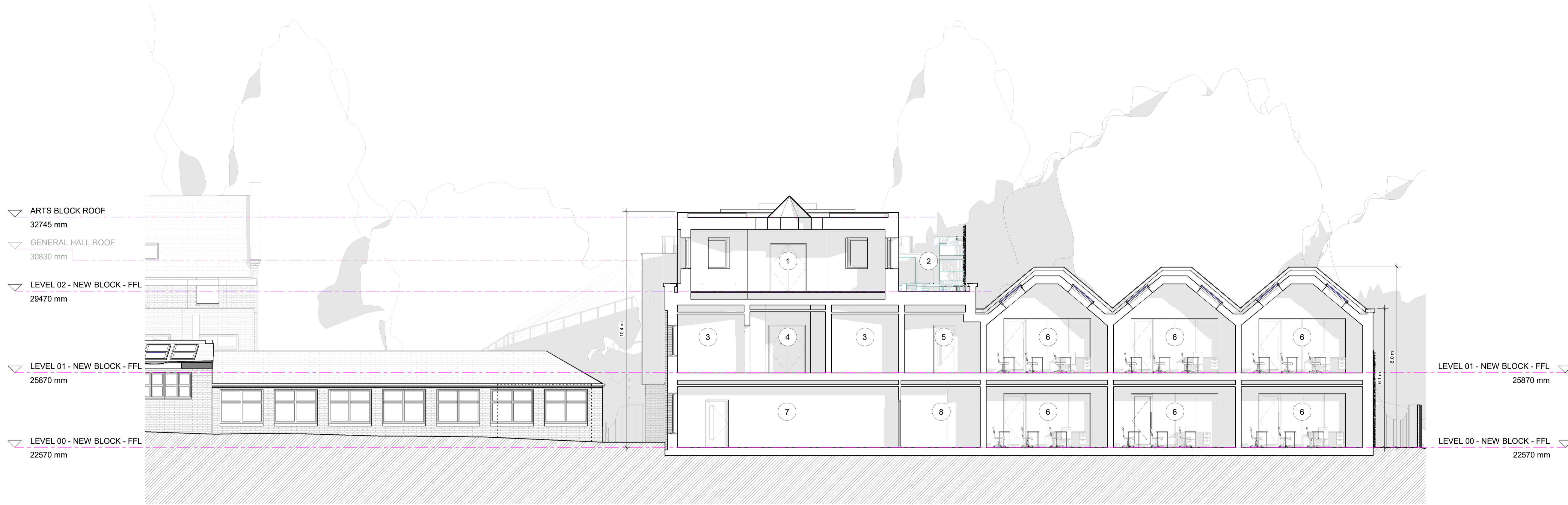
1 PLANNING - SECTION - NEW BLOCK - CLASSROOMS 1 : 100