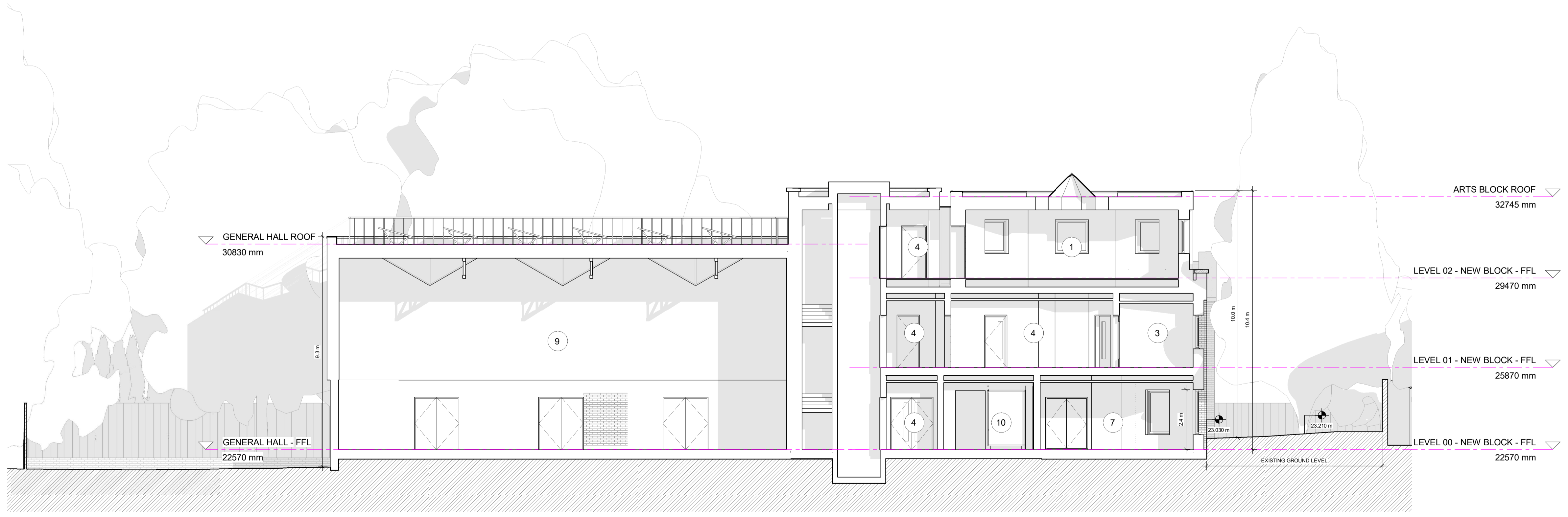
2 PLANNING - SECTION - GENERAL HALL 1 : 100