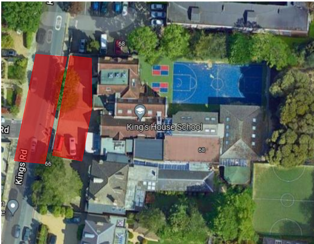
Figure 1 - Access via King road