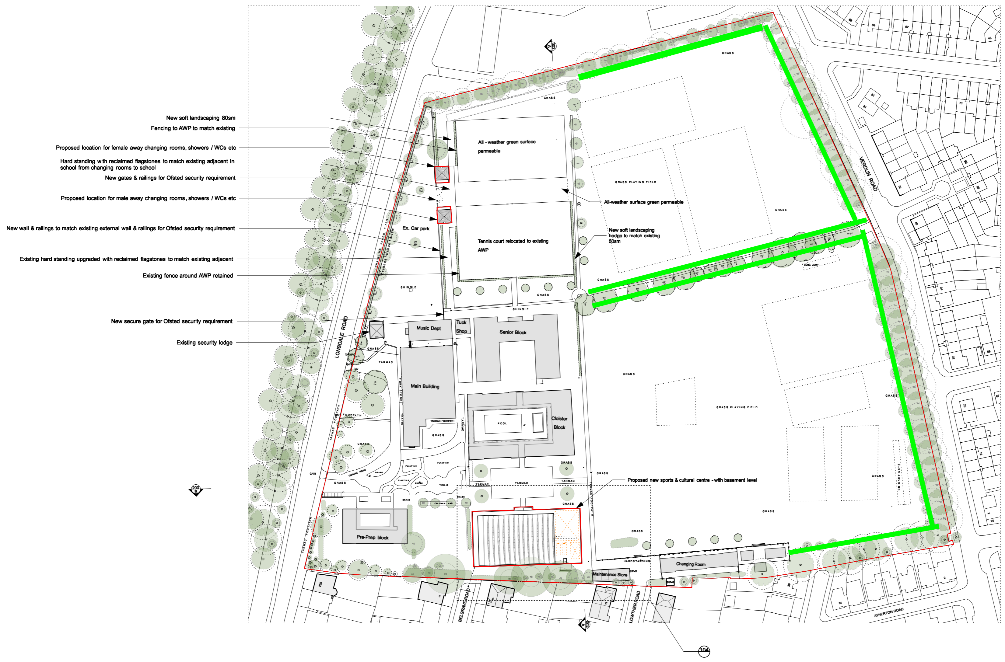
Proposed Site Plan 1:1250@A2

N.B: DRAWINGS FOR INFORMATION ONLY N.B: NEW SOFT LANDSCAPING TO LANDSCAPE ARCHITECTS DRAWINGS TO MATCH EXISTING