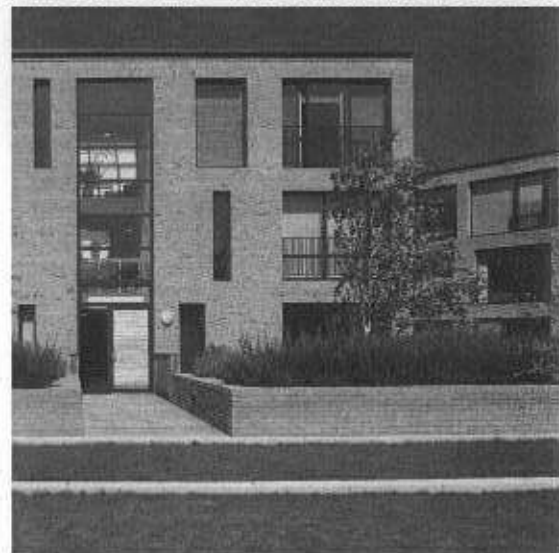
BENNET'S COURTYARD - MERTON - FEILDEN CLEGG BRADLEY