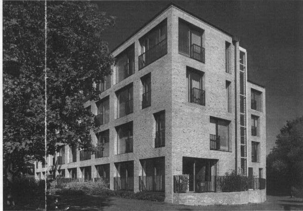
BENNET'S COURTYARD - MERTON - FEILDEN CLEGG BRADLEY