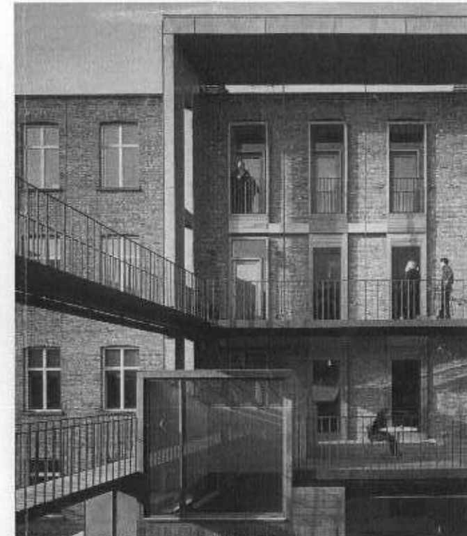
OFFICES, FITZROVIA - BUSCHOW HENLEY