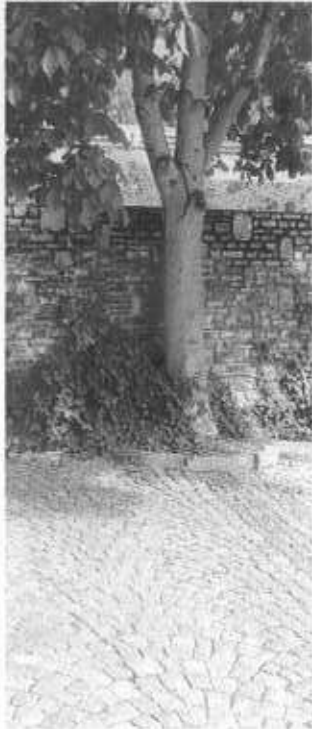
TYPICAL MEWS SPACE