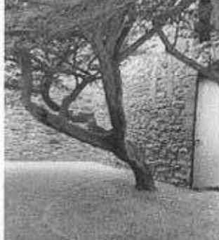
COBBLE PAVING & TREES