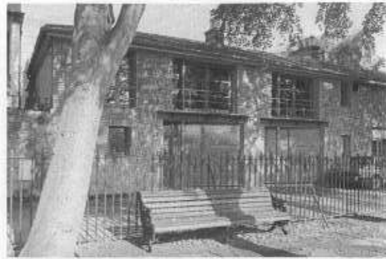
CLYDE LANE MEWS - IRELAND