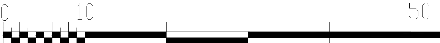
SITE LOCATION PLAN SCALE - 1:250