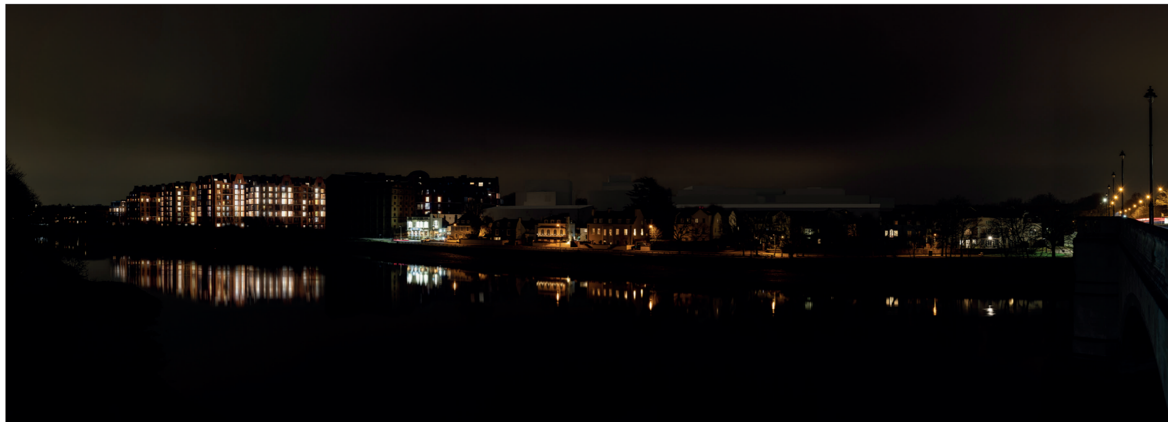
Viewpoint 4: Proposed night-time view from the northern end of Chiswick Bridge across the River Thames, towards the Stag Brewery component of the Site.