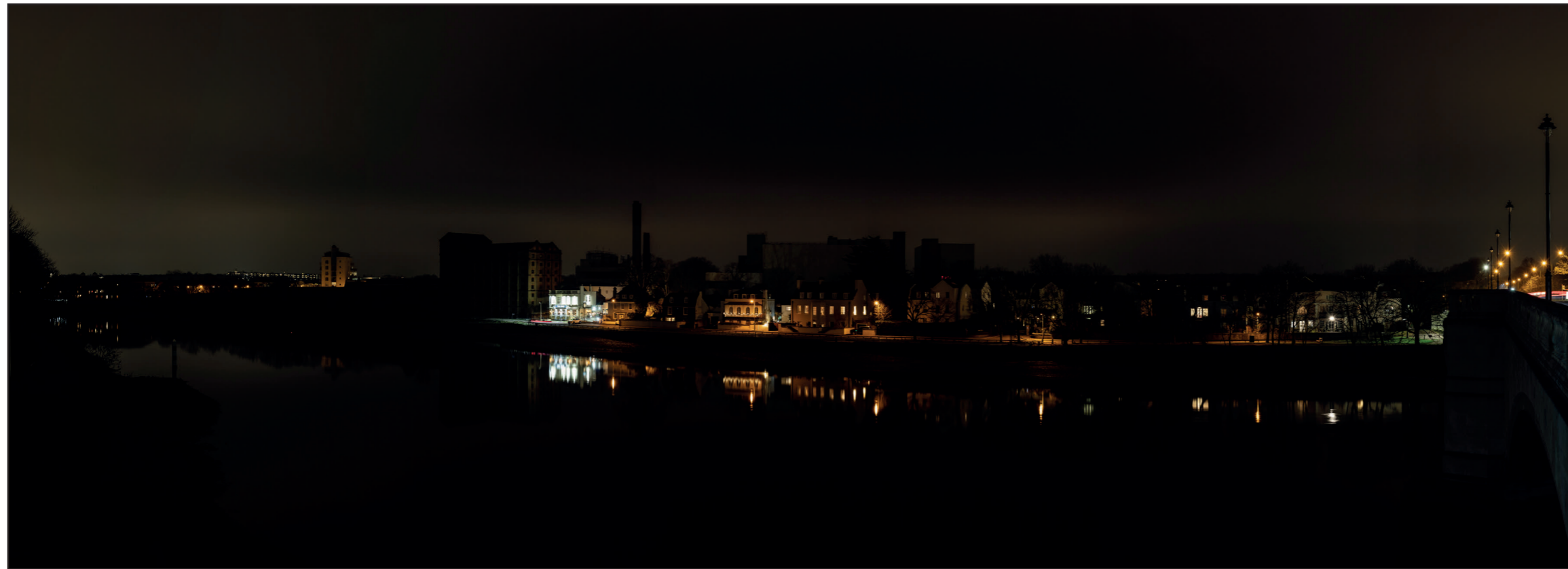
Viewpoint 4: Existing night-time view from the northern end of Chiswick Bridge across the River Thames, towards the Stag Brewery component of the Site