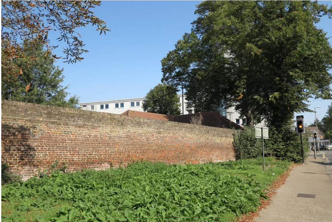
Plate 17. View towards Kingston Bridge House from Hampton Court Road, looking over the boundary walls of Bushy Park