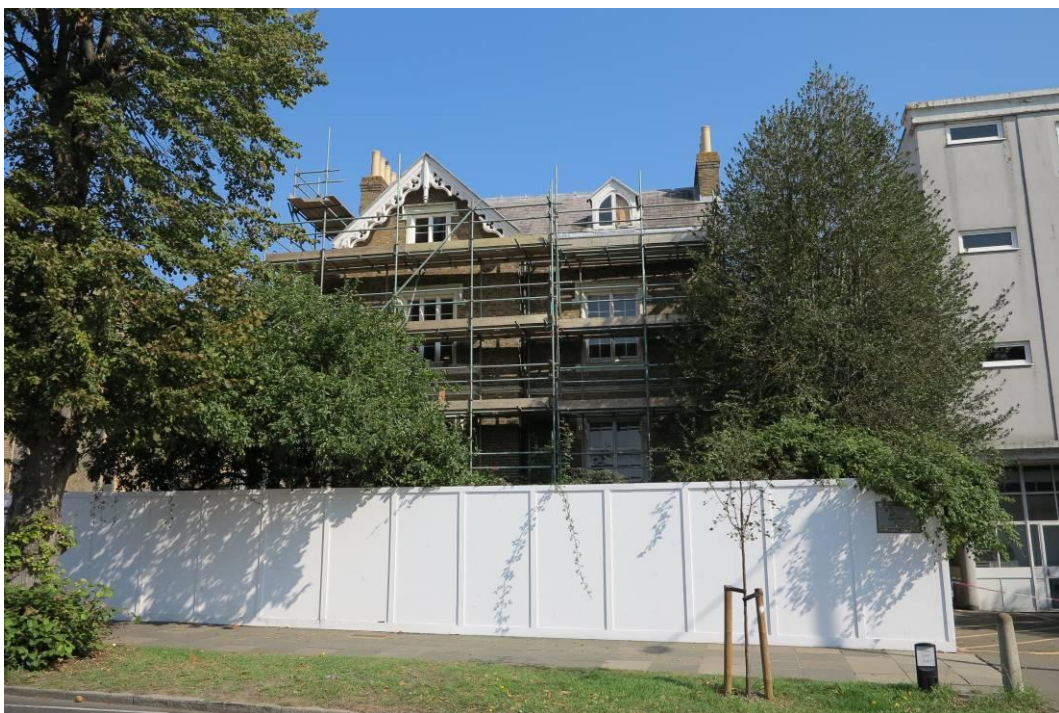
Plate 18. 4 Church Grove