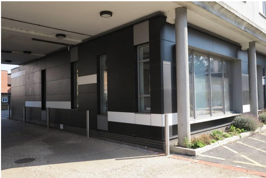
Plate 4. The undercroft has been partially infilled in the 1990s