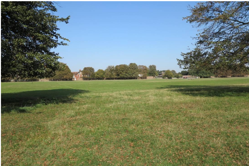
Plate 28. View towards the northern boundary of Hampton Court Park from the north-eastern arm of the avenue