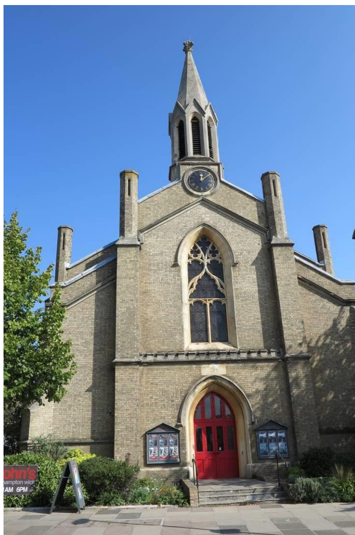
Plate 20. St. John's Church