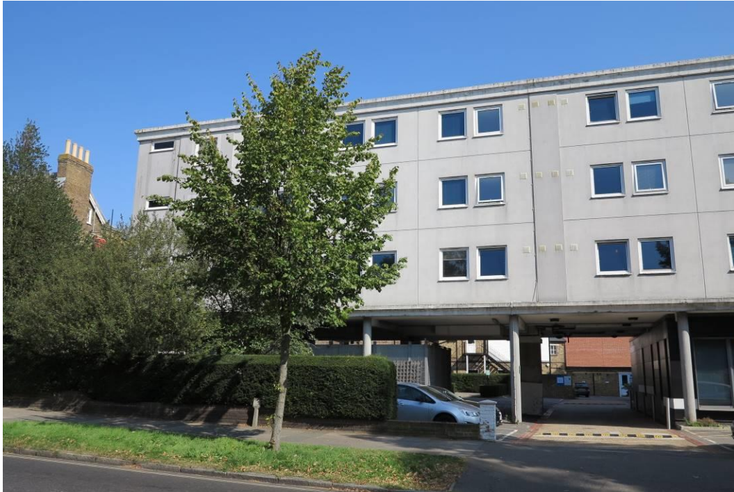
Plate 3. The northern range of Kingston Bridge House from the west