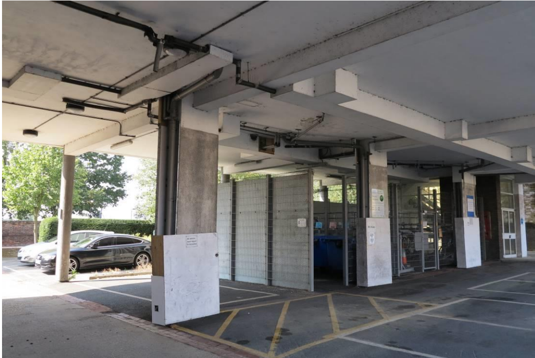
Plate 5. The undercroft has been partially infilled with a bin store