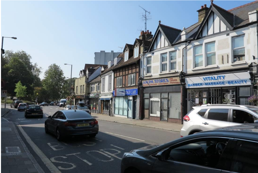
Plate 9. Kingston Bridge House is visible from the southern end of the High Street