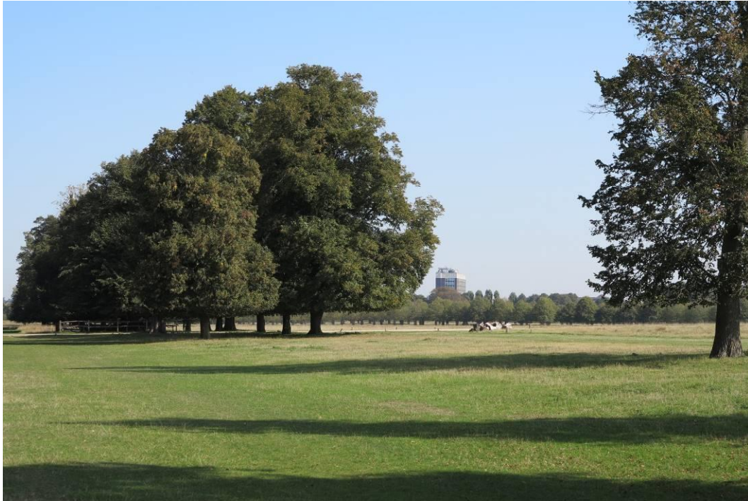
Plate 29. The tower of Kingston College is visible to the east of Hampton Court Park