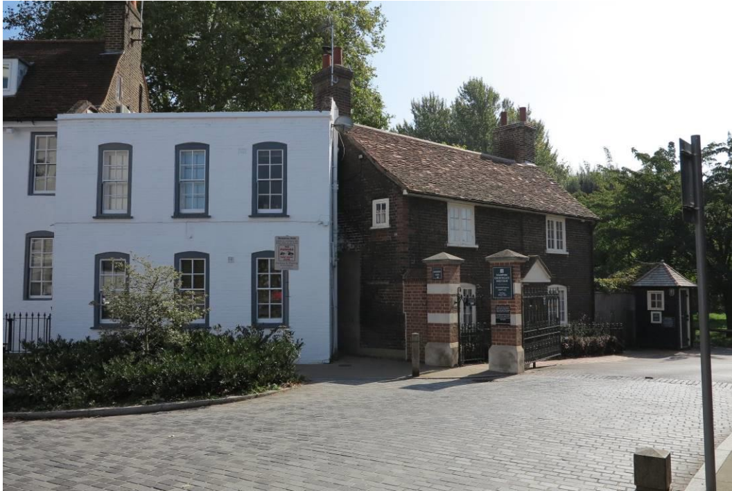
Plate 13. Home Park Terrace – Hampton Court Park Lodge