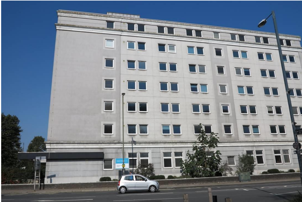
Plate 1. Kingston Bridge House from the south