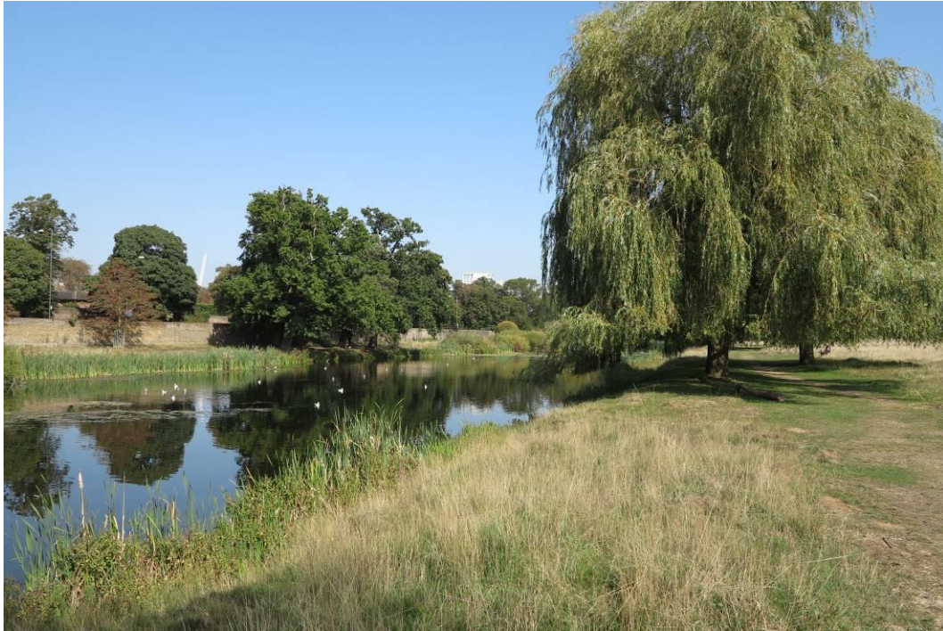
Plate 31. Glimpse of Kingston Bridge House from the north-eastern edge of Hampton Court Park