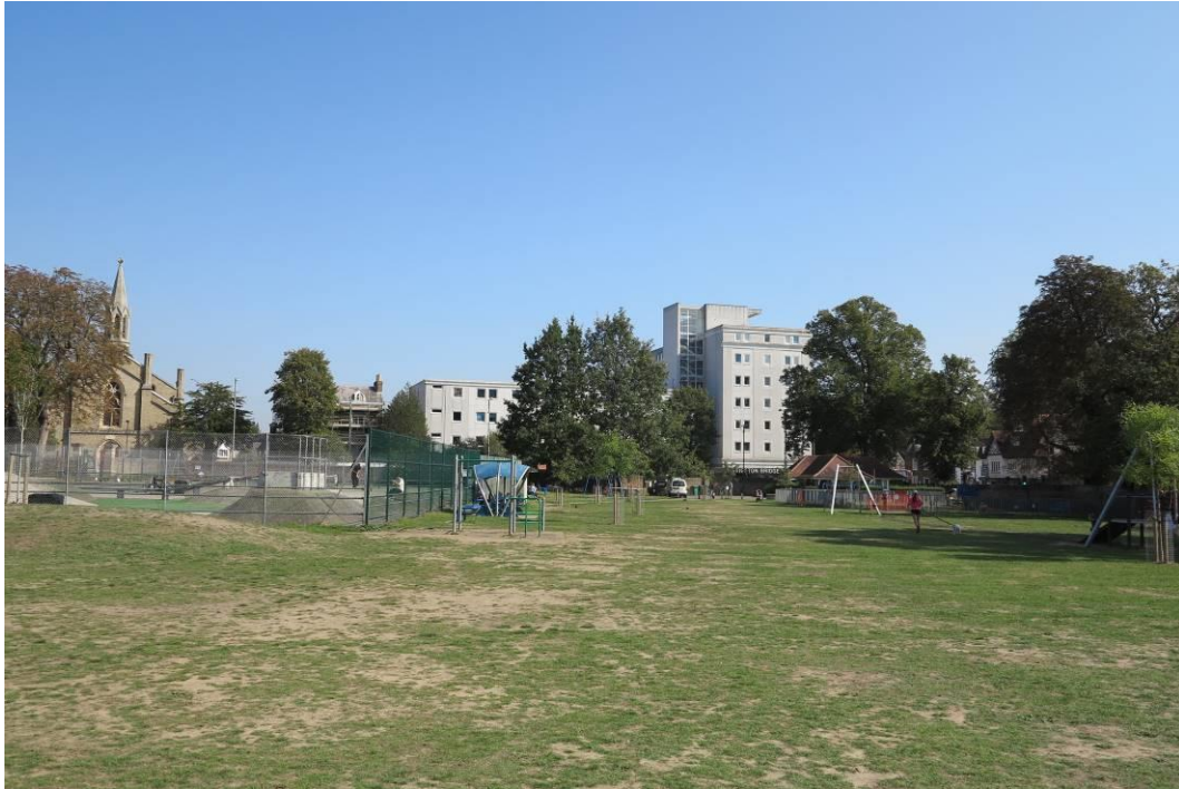
Plate 23. View towards Church Grove from the King's Field