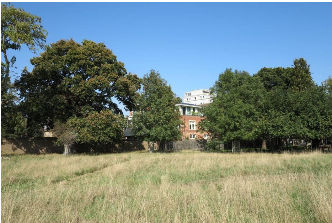
Plate 32. Kingston Bridge House is visible over the roof terrace of 5-11 Hampton Court Road from the north-eastern edge of Hampton Court Park