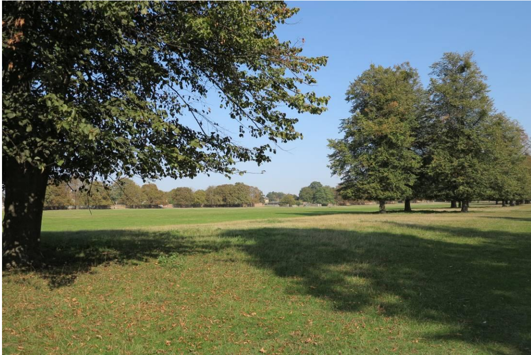
Plate 27. The north-eastern arm of the triple avenue in Hampton Court Park