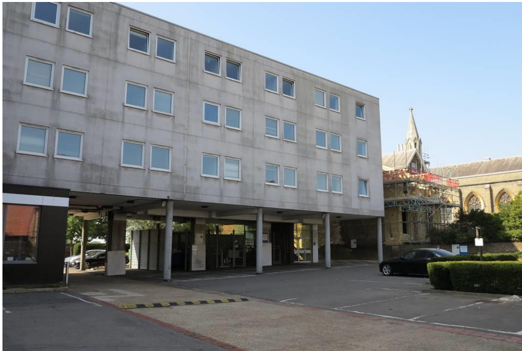
Plate 7. The rear of the northern range of Kingston Bridge House