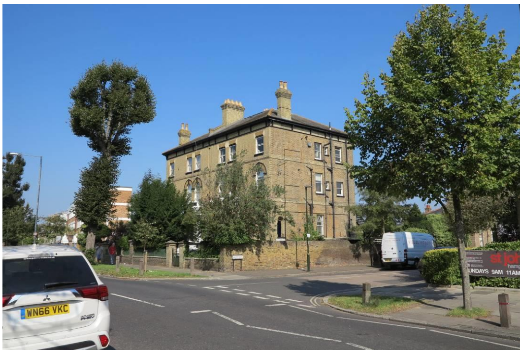
Plate 19. 6-8 Church Grove