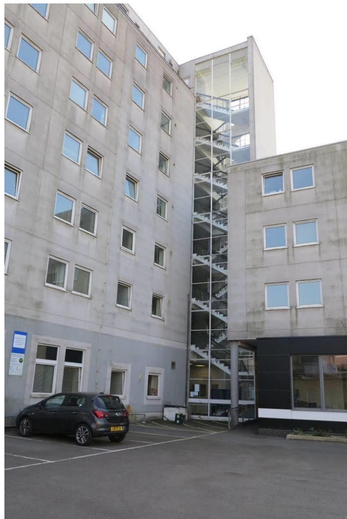
Plate 6. The stair core from the rear