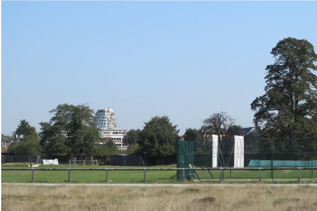
Plate 25. Heron House and the Admiralty Building seen over the cricket pitch in Bushy Park