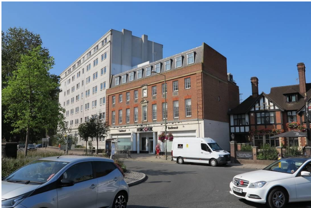
Plate 8. The former Gas Board building (now HSBC)