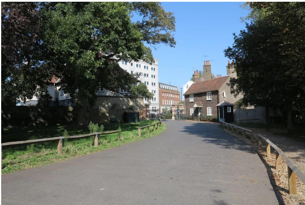
Plate 16. View towards Church Grove from outside the north-eastern entrance to Hampton Court Park