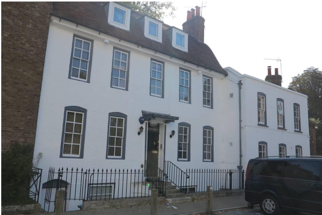
Plate 12. Home Park Terrace – the Park House