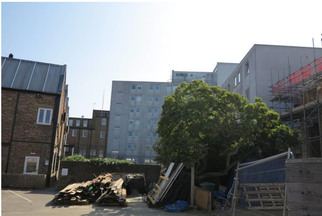
Plate 22. View towards Kingston Bridge House from the car park to the rear of 4 Church Grove