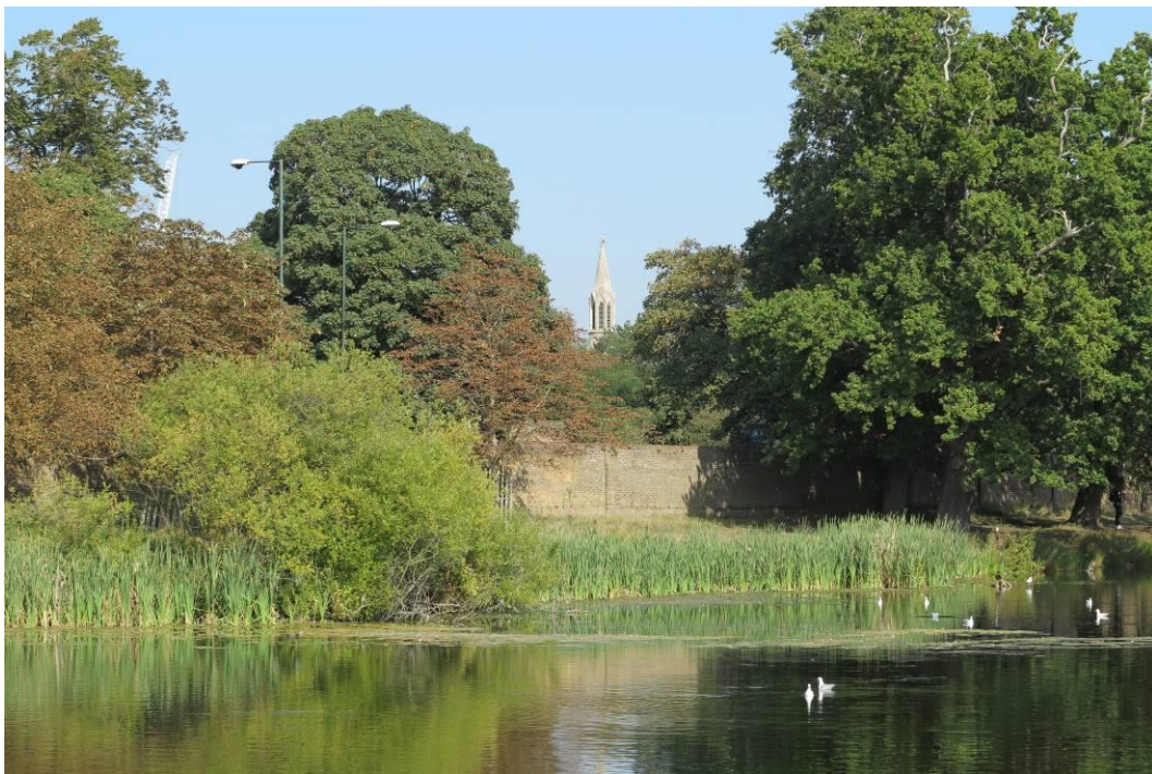
Plate 30. Glimpse of the spire of St. John's Church from the north-eastern edge of Hampton Court Park