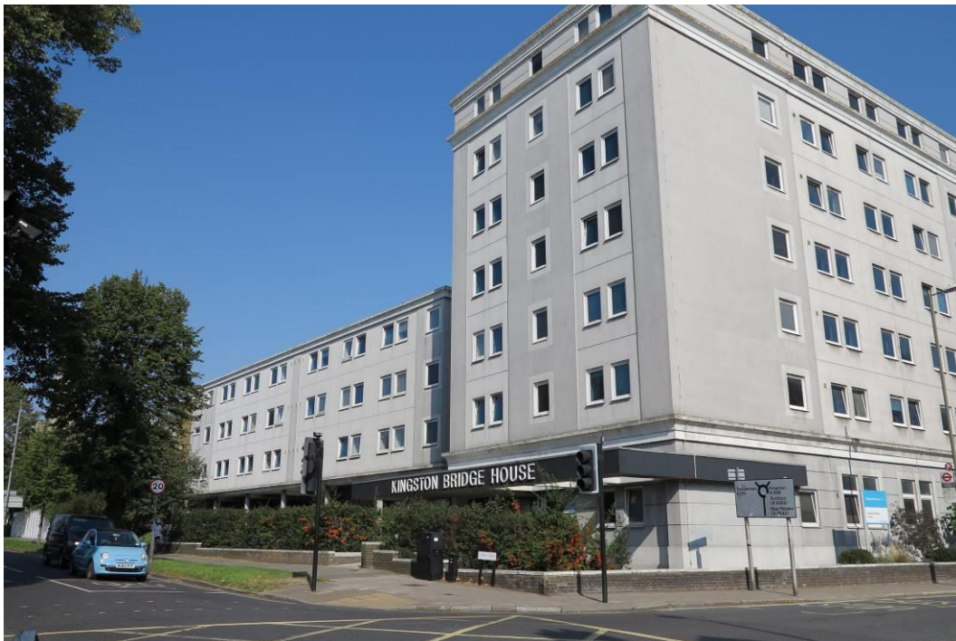
Plate 2. Kingston Bridge House from the south-west