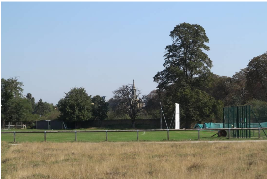
Plate 26. The spire of St. John's Church seen over the cricket pitch in Bushy Park