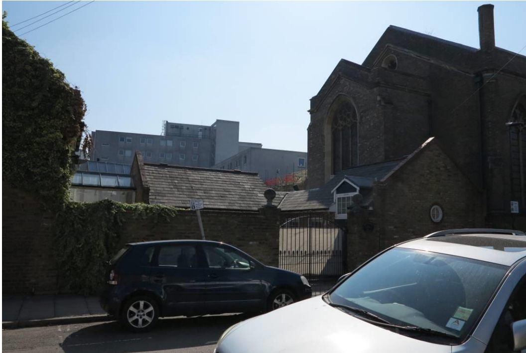
Plate 21. View towards Kingston Bridge House from St. John's Street, over the yard to the east of St. John's Church