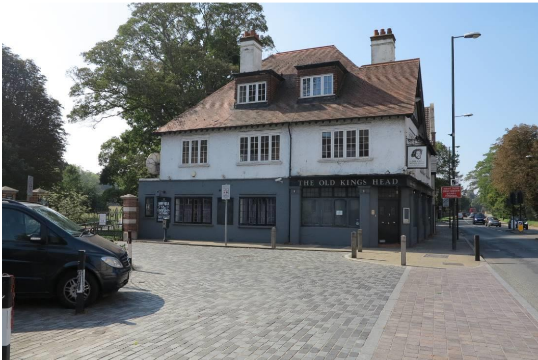
Plate 14. The Old King's Head