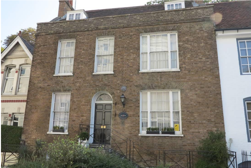
Plate 11. Home Park Terrace – the Gate House