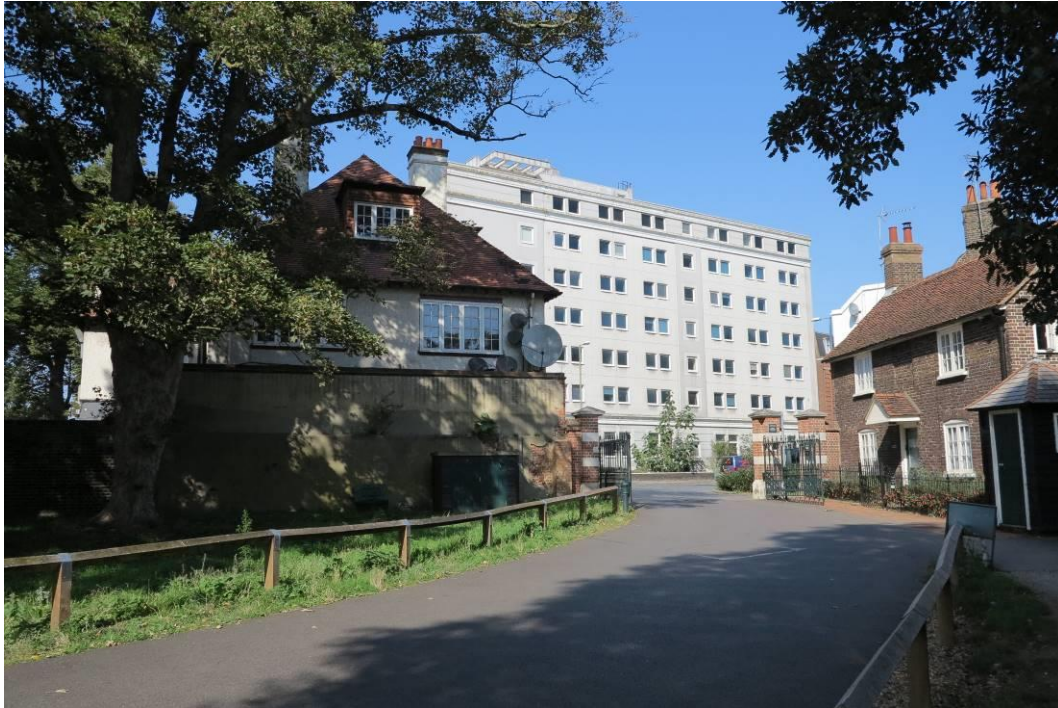
Plate 15. Kingston Bridge House from the north-eastern entrance to Hampton Court Park