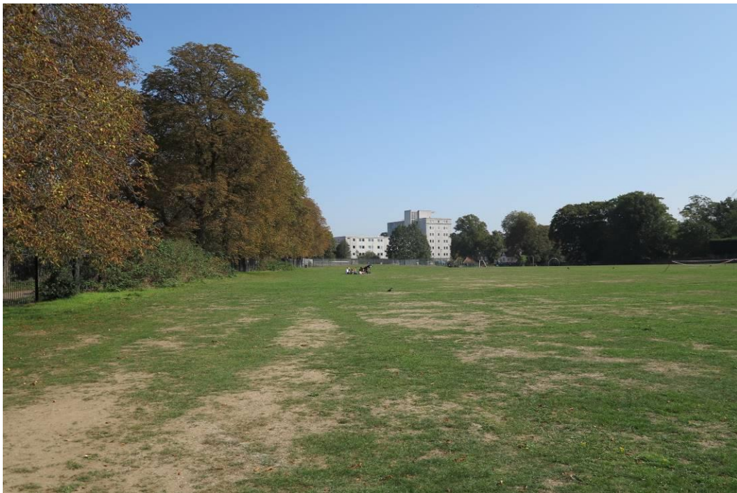
Plate 24. View towards Church Grove from the western end of King's Field