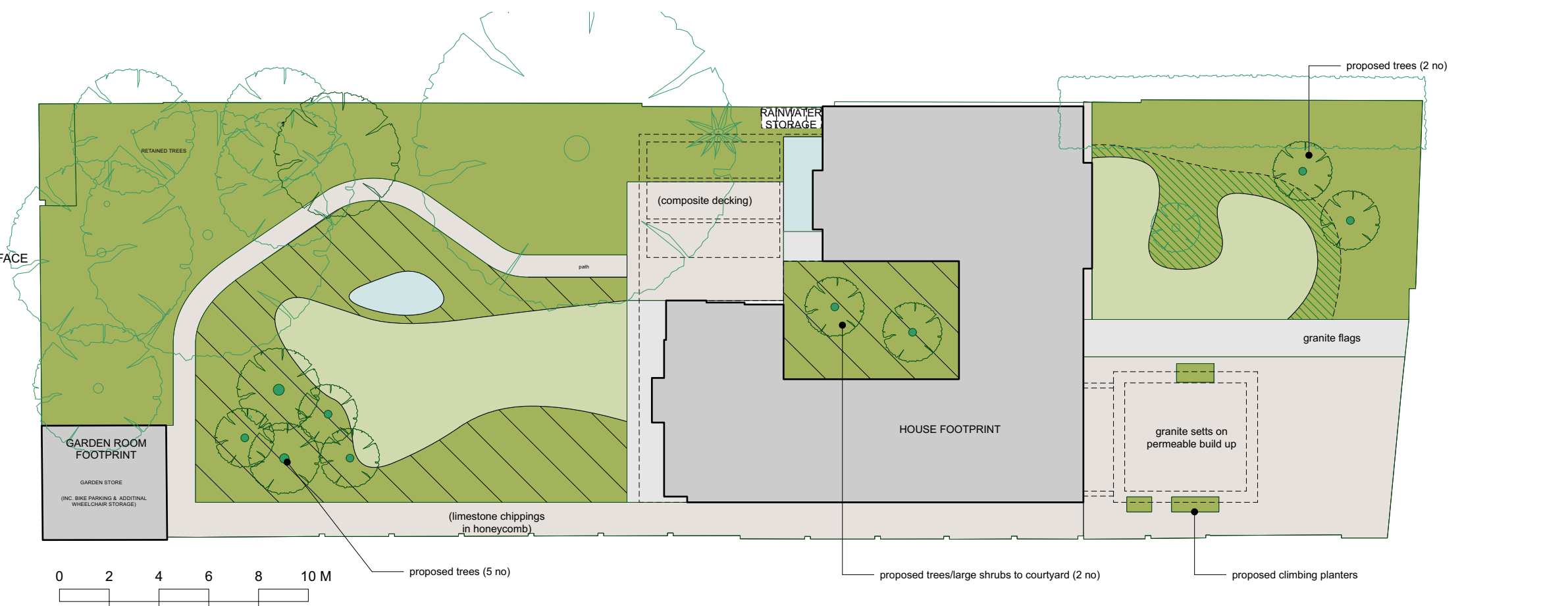
1 Proposed Site Ground Floor Landscape Plan Scale: 1:200

1. THIS DRAWING IS COPYRIGHT 2. DO NOT SCALE WORK TO FIGURED DIMENSIONS ONLY 3. THE CONTRACTOR MUST CHECK ALL DIMENSIONS AND LEVELS ON SITE AND CONFIRM WITH ARCHITECT BEFORE PROCEEDING. EXISTING LEVELS \blacktriangleleft \blacktriangleright NEW LEVELS \blacktriangleleft \blacktriangleright 4. DISCREPANCIES BETWEEN THE DRAWING AND THE SPECIFICATIONS MUST BE REPORTED TO THE ARCHITECT BEFORE PROCEEDING 5. FOR DETAILS OF STRUCTURE, REFER TO ENGINEER'S DRAWINGS AND SPECIFICATIONS