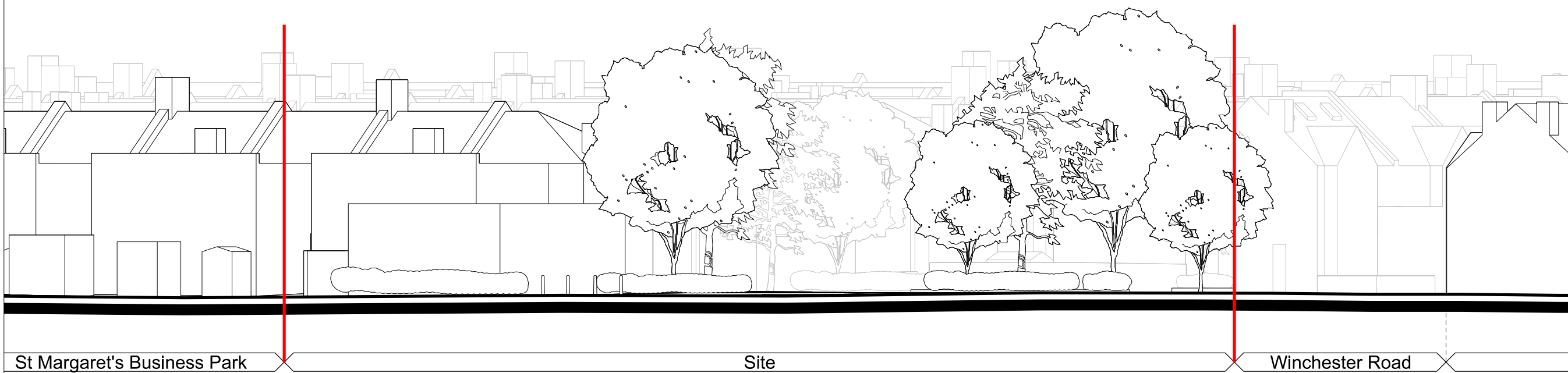
02 0021 South Elevation