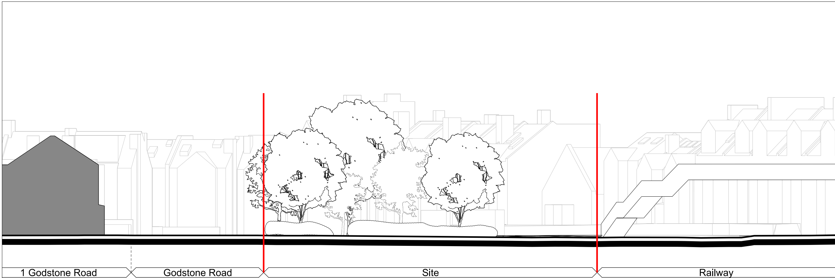
01 0021 West Elevation