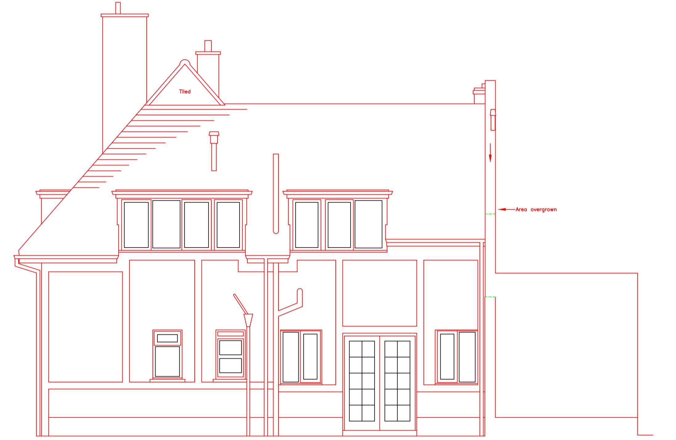
7.00m Datum SOUTH EAST ELEVATION