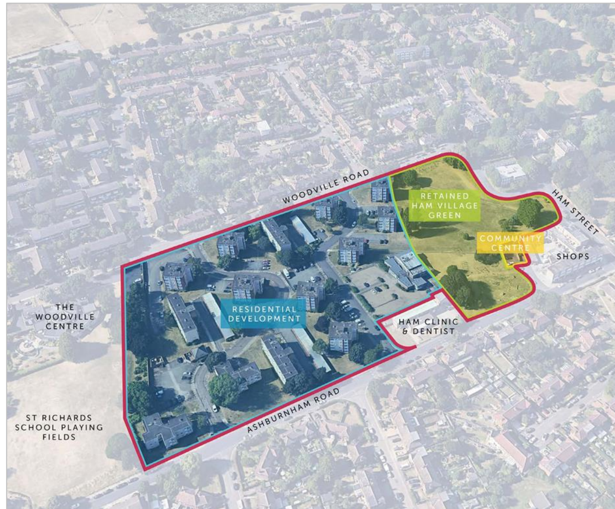
Figure 1.1 Existing site and adjacent areas