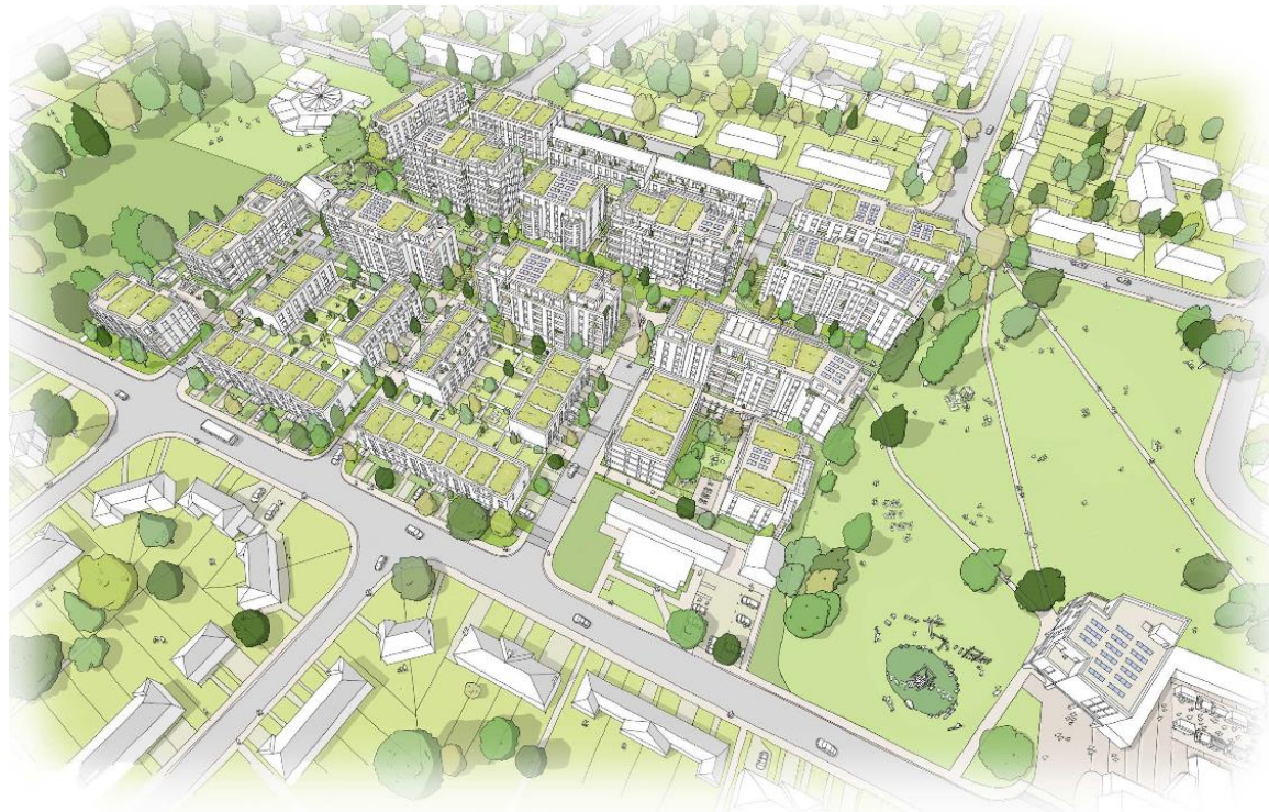
Figure 1.3 Aerial View

The Makers Labs will also be a stand-alone building re-providing the existing space on site. The Makers Labs is a space for people with an interest in DIY and craft. The existing space includes computer facilities, electronics lab, laser cutting, 3D printing, CNC (computer numerical control) machinery, metal lathe, kitchen facilities and informal wood shop.