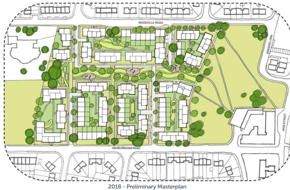
Figure 1.7 Masterplanning Brief Masterplan

The Figure 1.7 below diagram illustrates the scheme that formed the basis of the masterplanning brief.