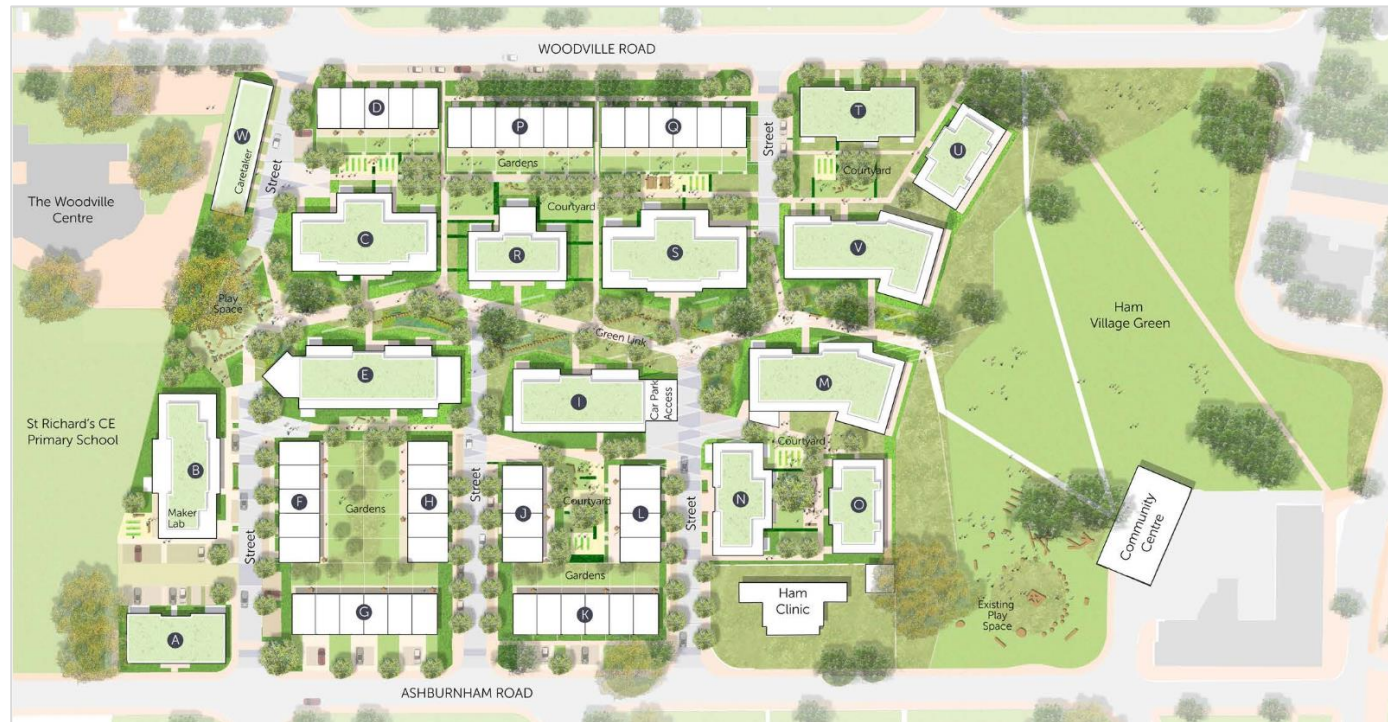
Figure 1.8 Preliminary Masterplan