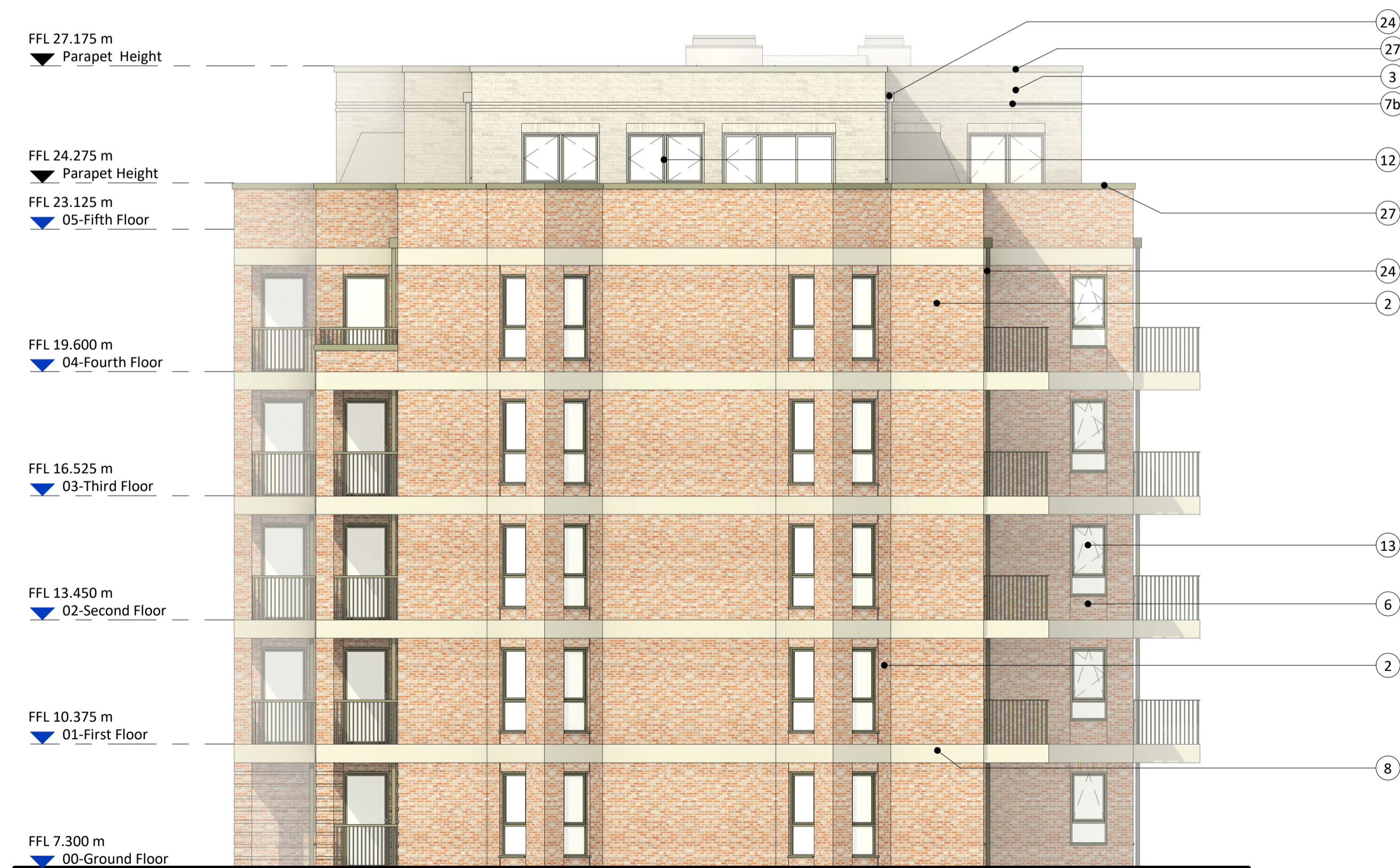
Elevation 2 1 : 100