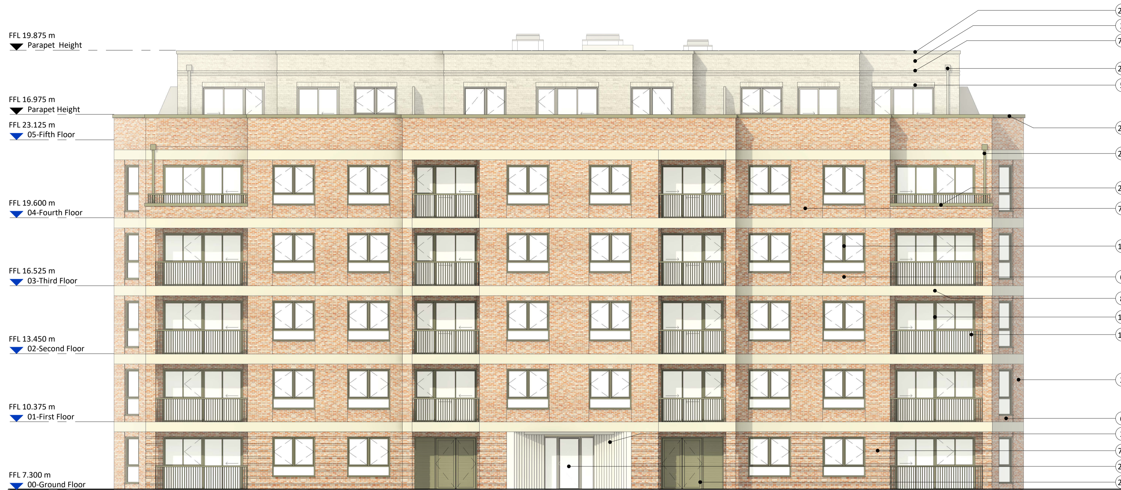
Elevation 1 1 : 100