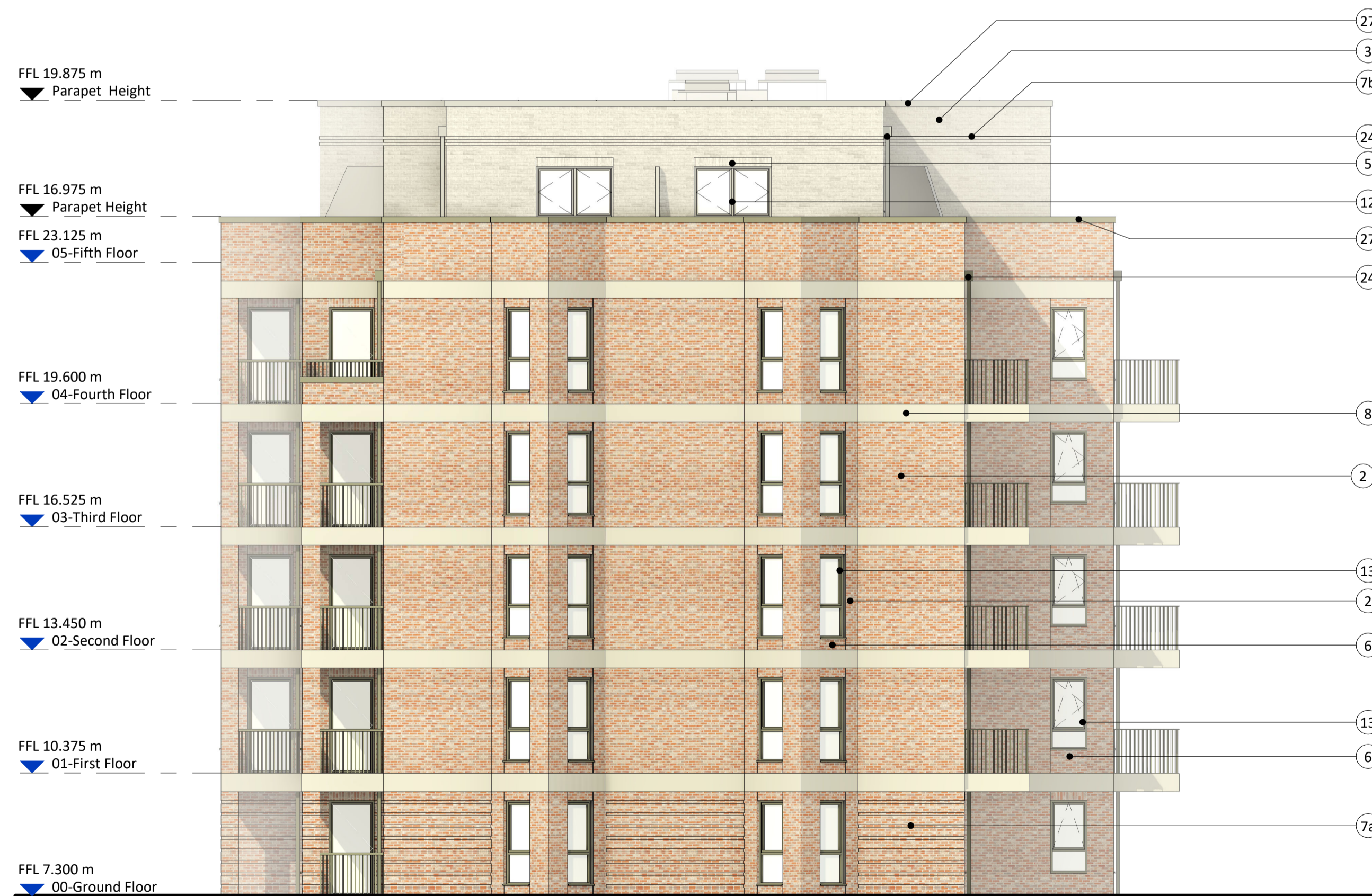
Elevation 2 1 : 100