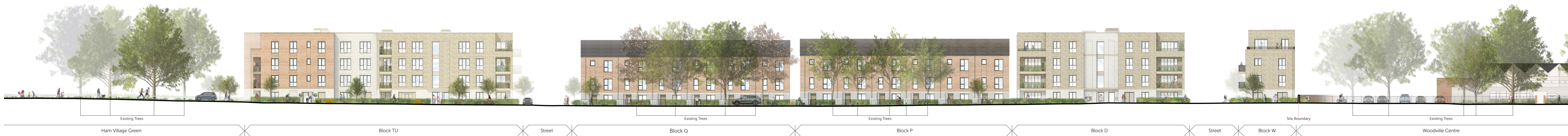
Elevation 01 - Woodville Road Scale 1:250