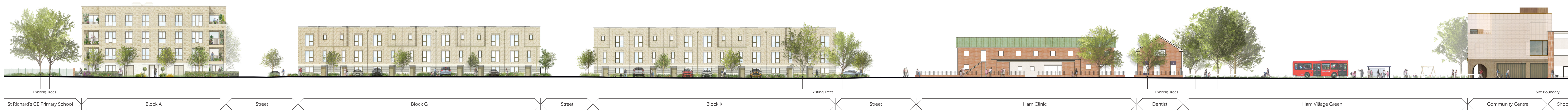
Elevation 02 - Ashburnham Road Scale 1:250